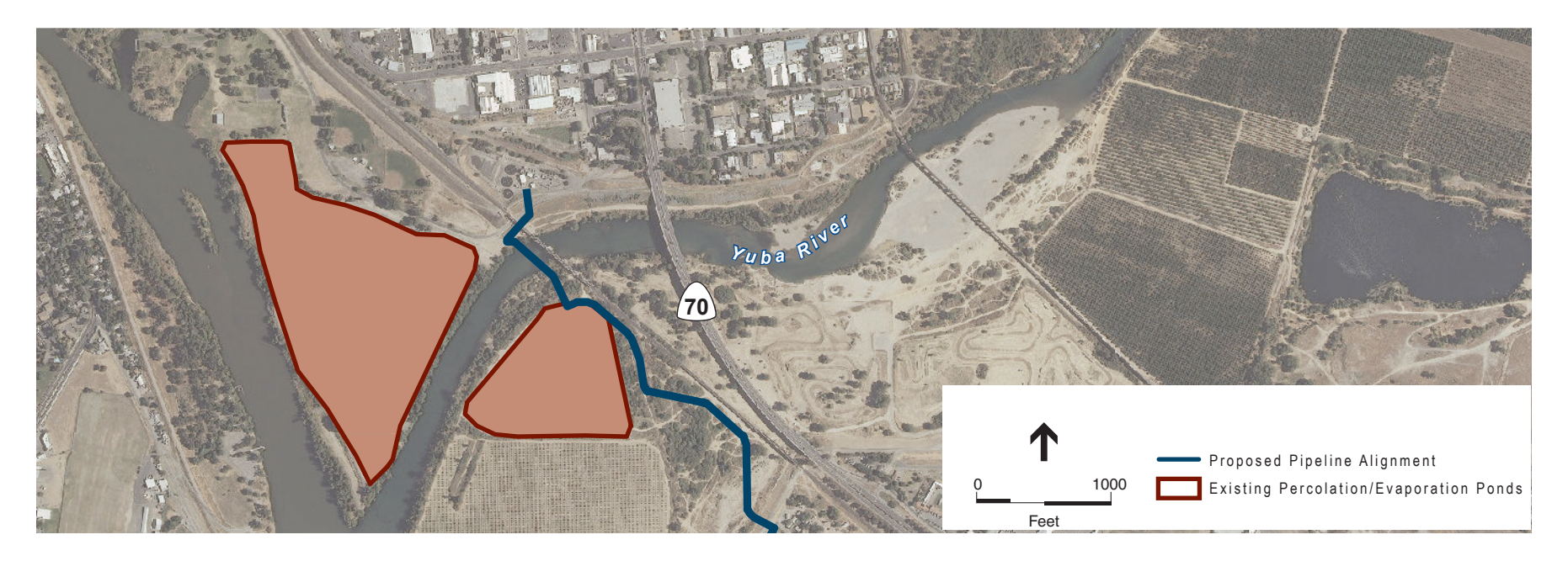
Figure 1. Proposed pipeline realignment within USACE Section 408 jurisdiction; Yuba River Section.