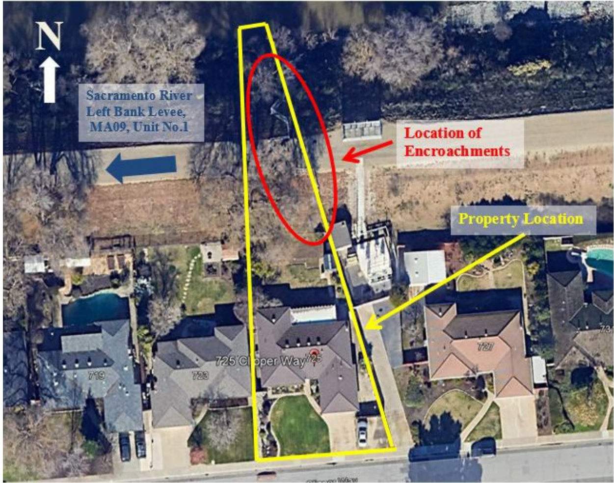
3) Approximate project footprint map