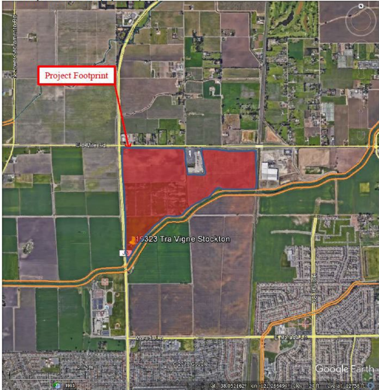
3) Approximate project footprint map

(Note: The project footprint must show the maximum extent of the proposed project in addition to staging areas and access routes if applicable. Two aerial maps may be required if staging areas and access routes are not adjacent to the main project footprint.)