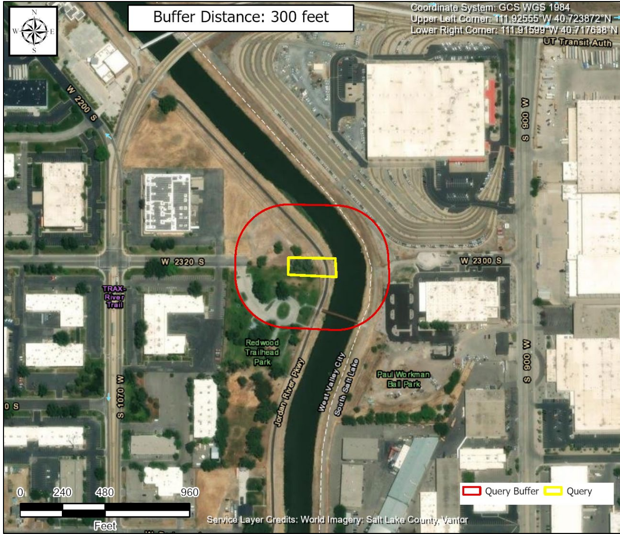
2) Proposed project location map