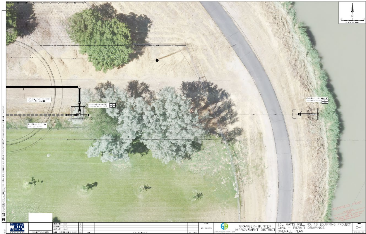
3) Approximate project footprint map