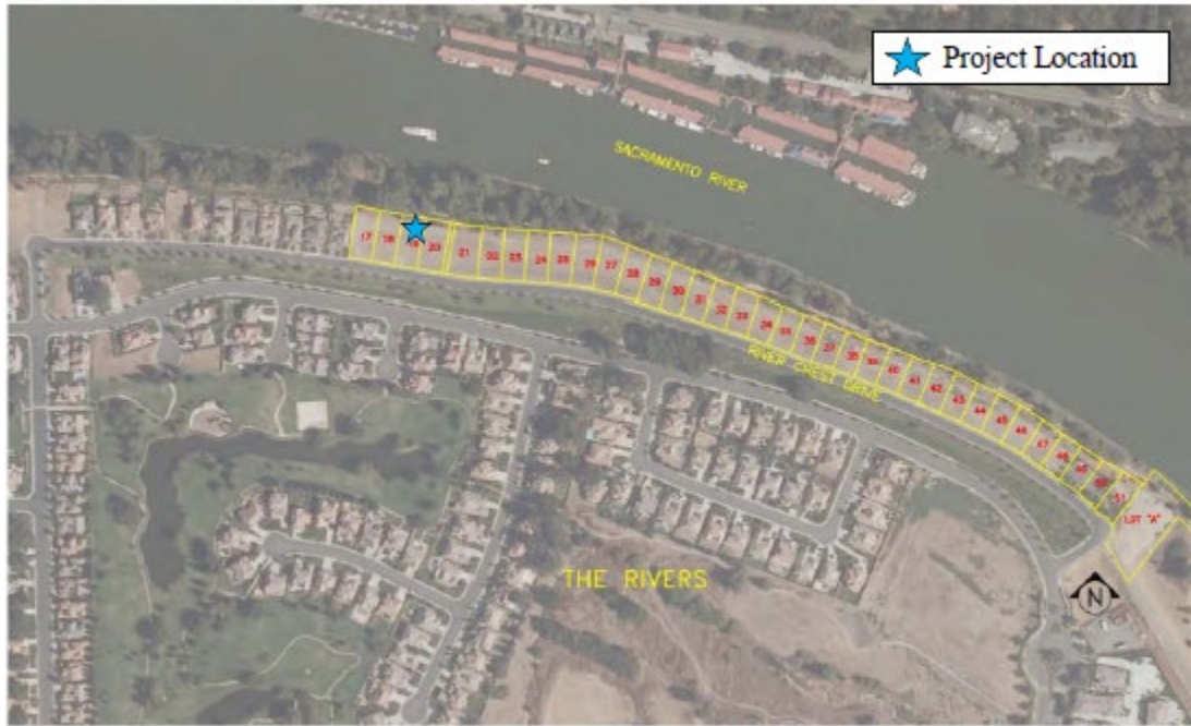
Figure 1. Site Map of Levee Lots