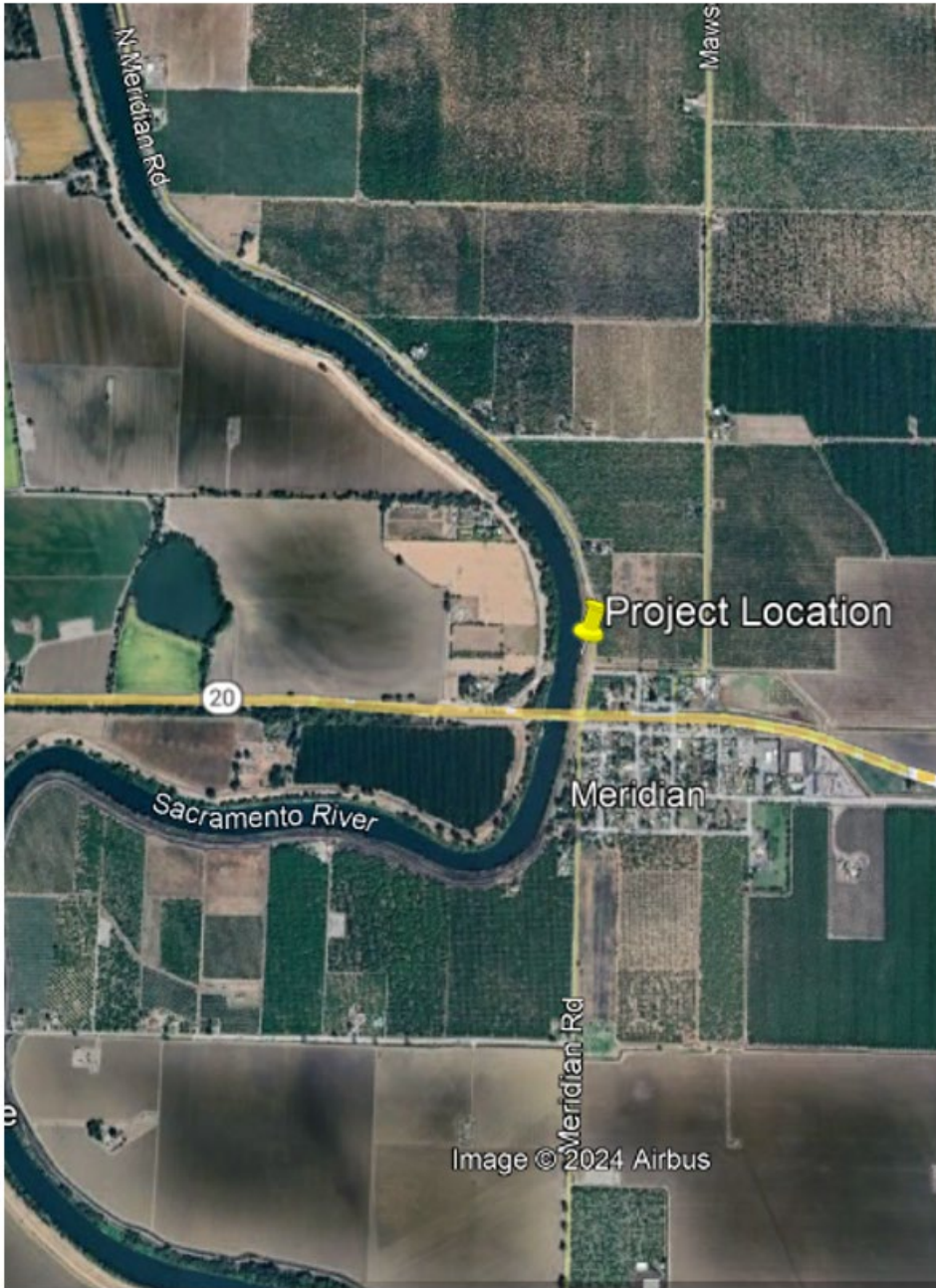
2) Proposed project location map