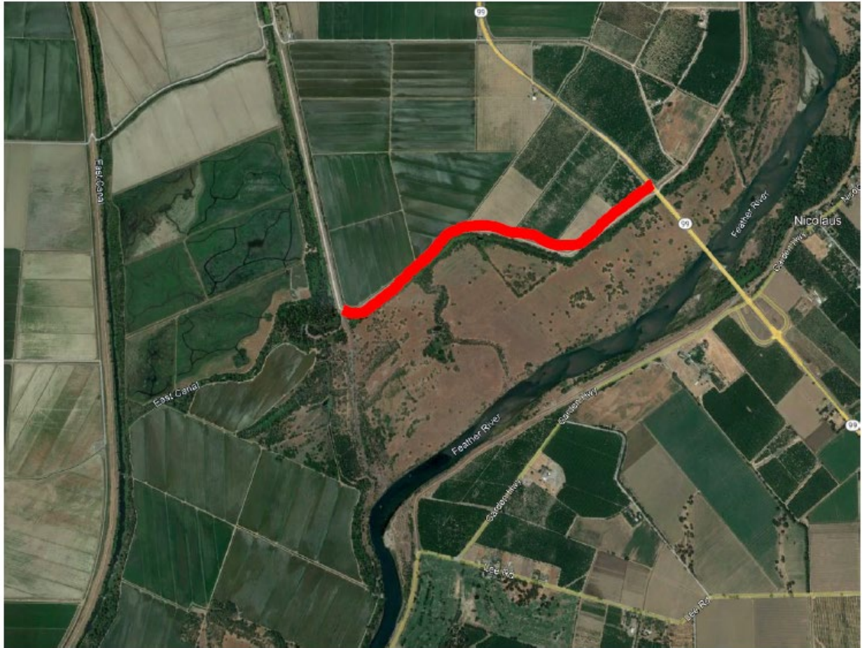
3) Approximate project footprint map