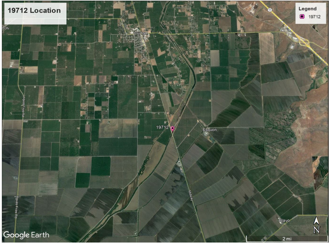
2) Proposed project location map