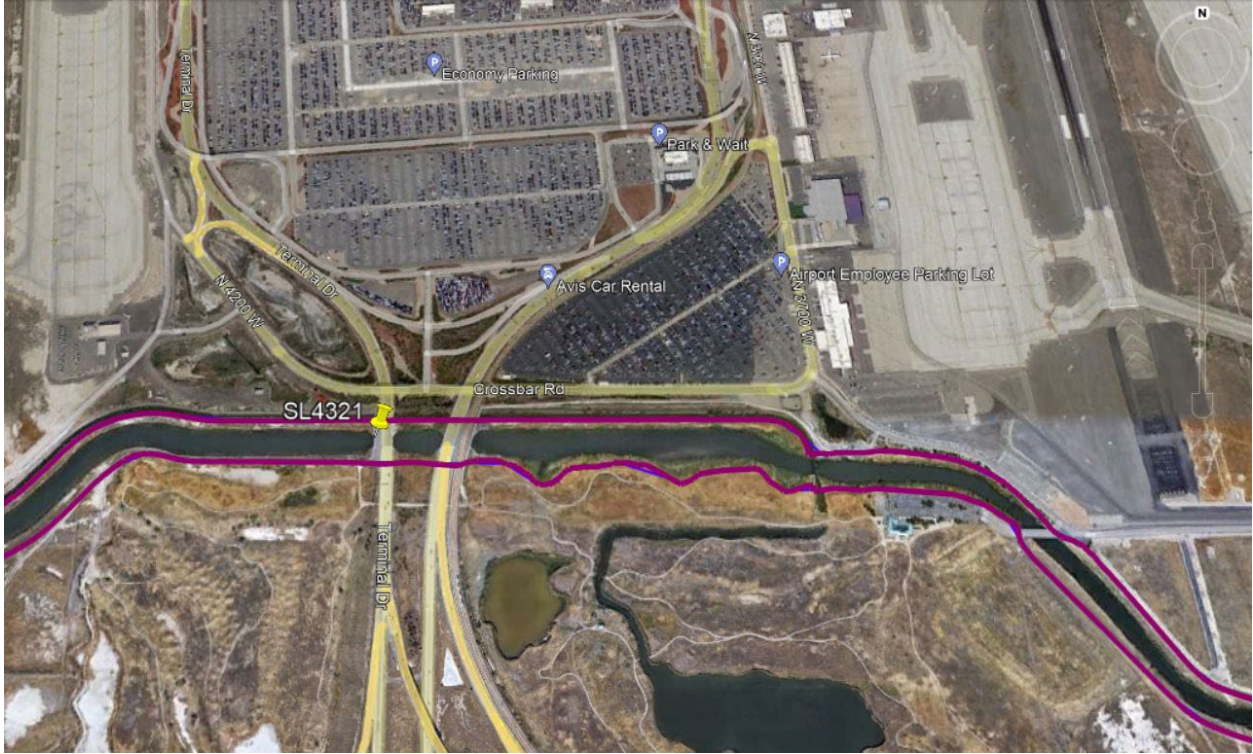
2) Project location map