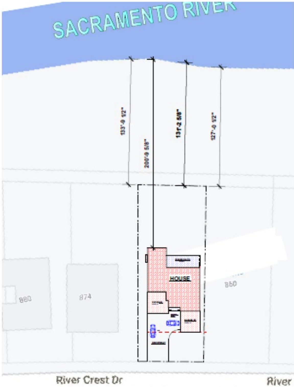
3) Approximate project footprint map