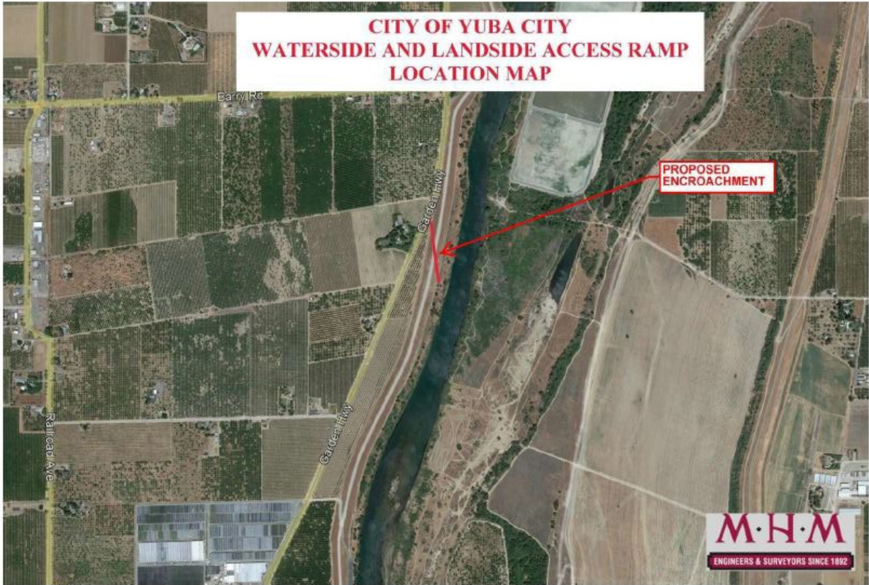
2) Proposed project location map