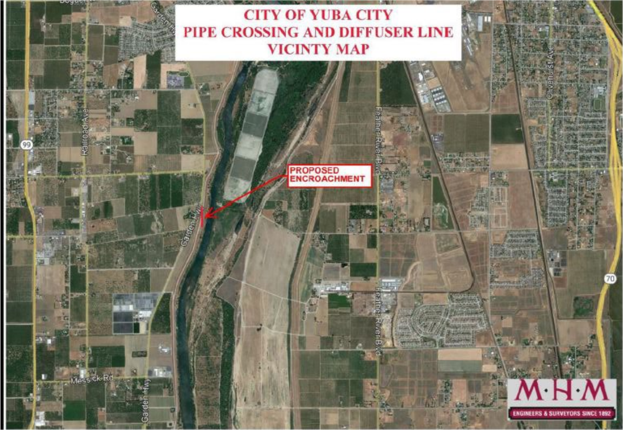
1) General vicinity map