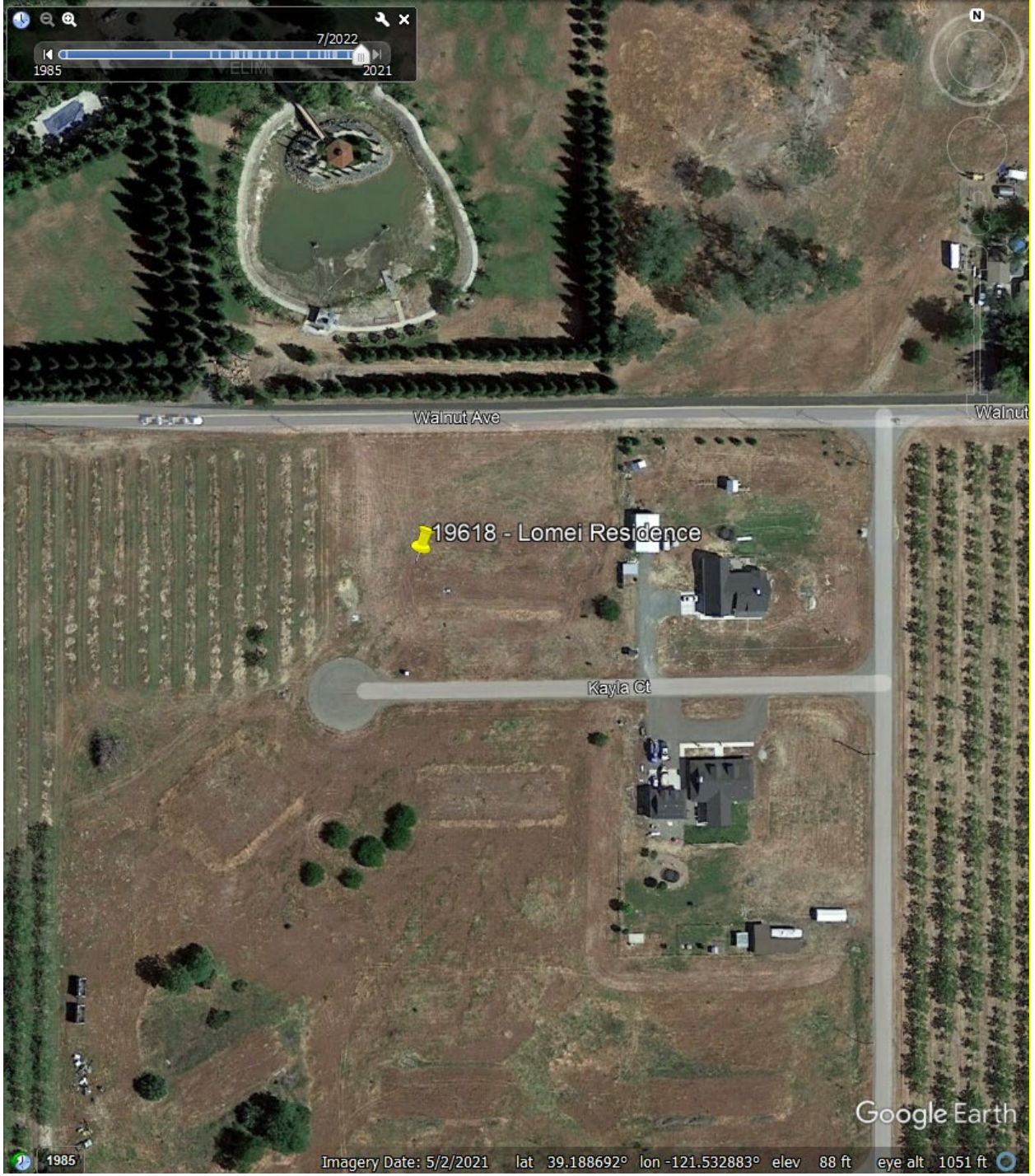
3) Project Footprint