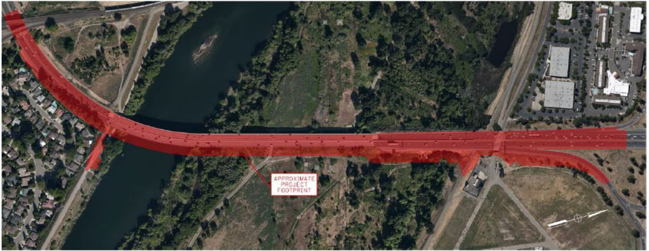
3) Approximate project footprint map