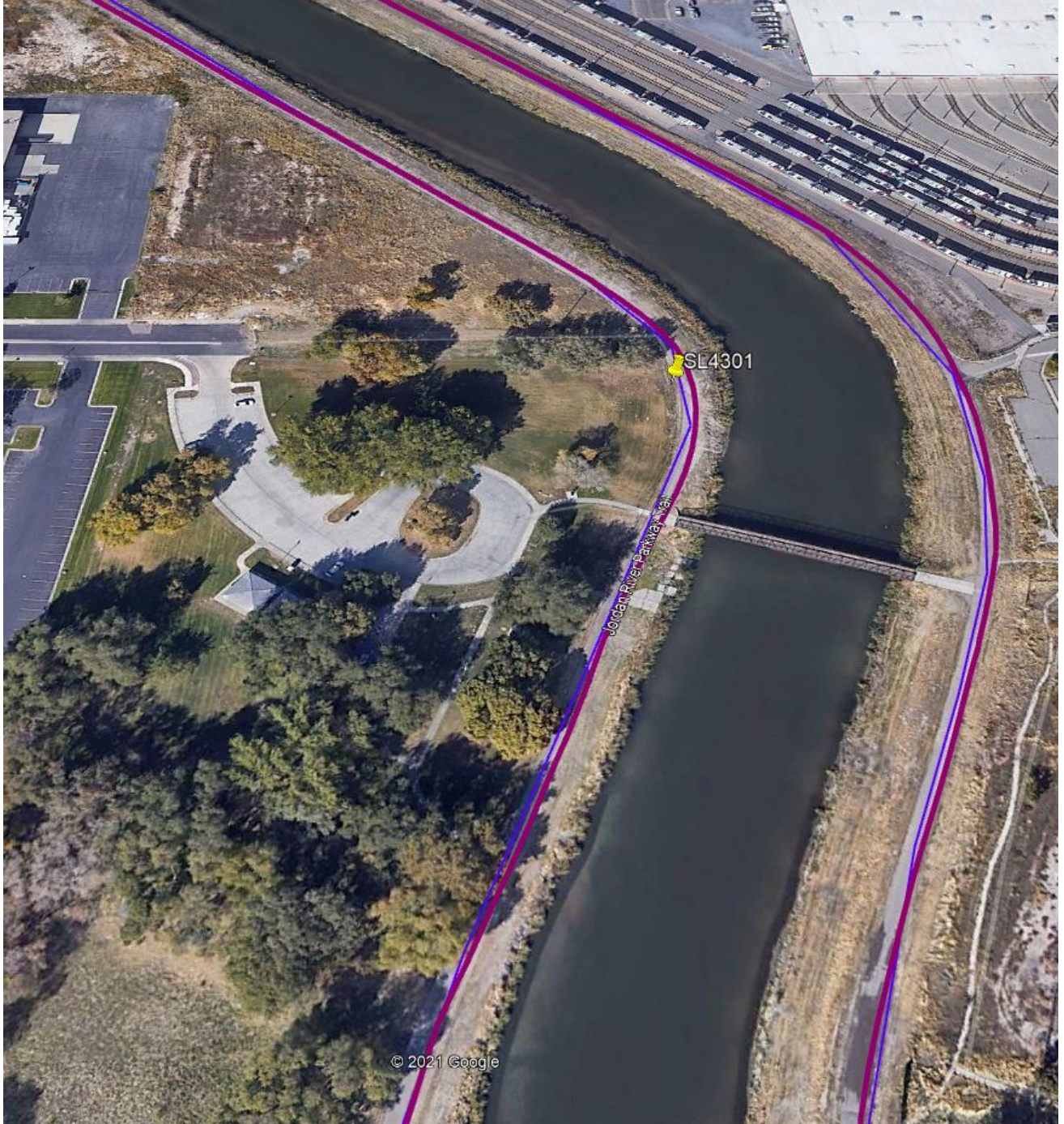
2) Location map