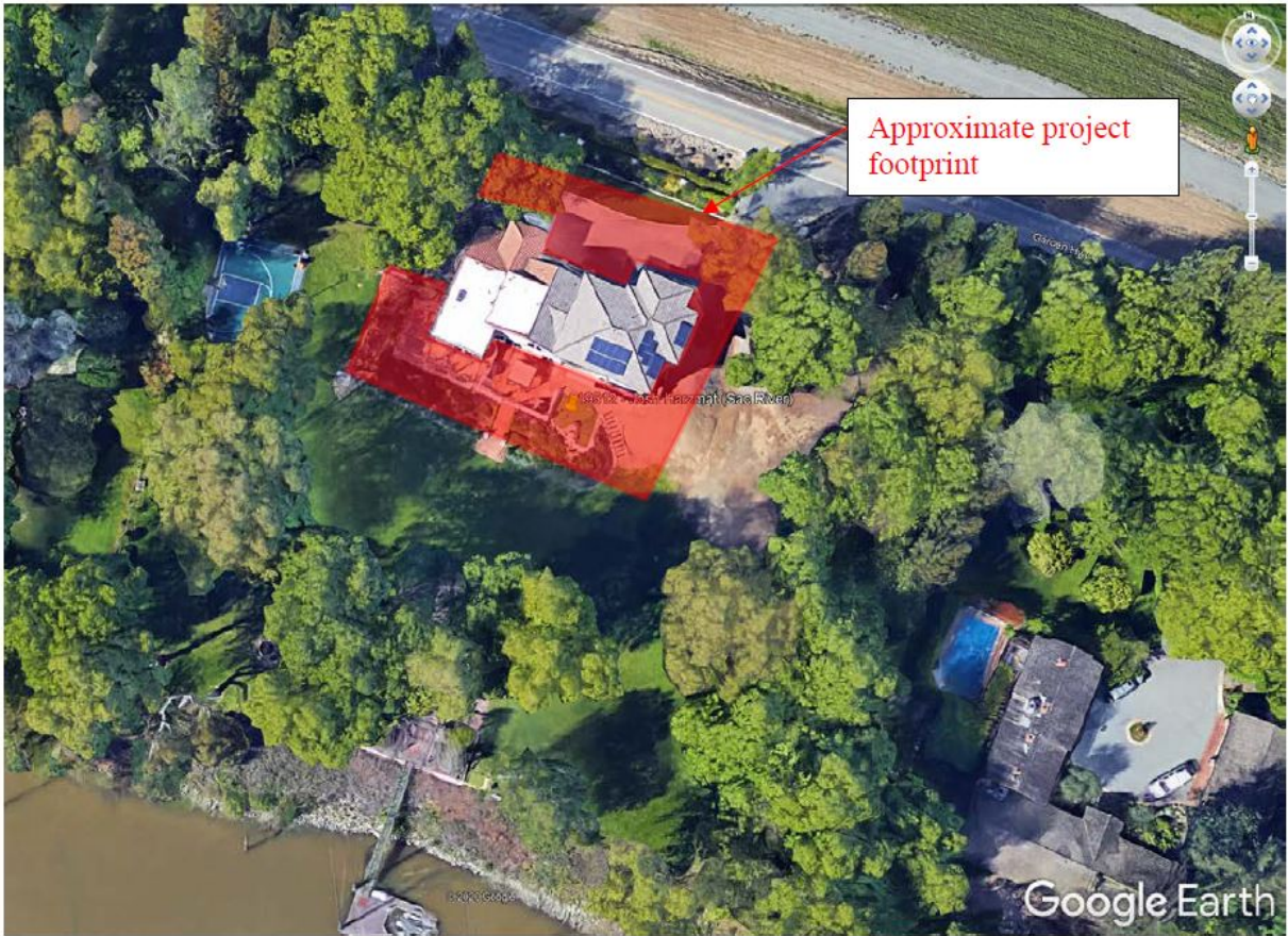
3) Proposed footprint map