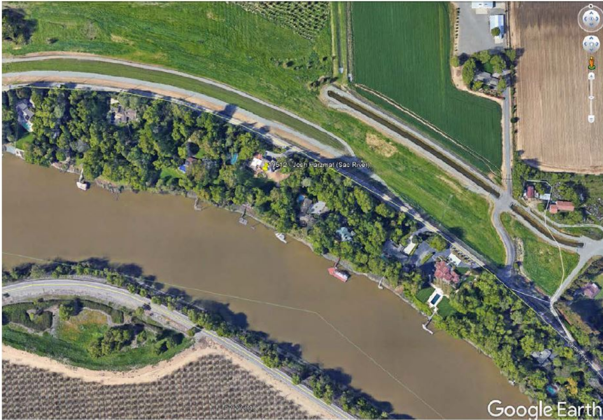
2) Project location maps