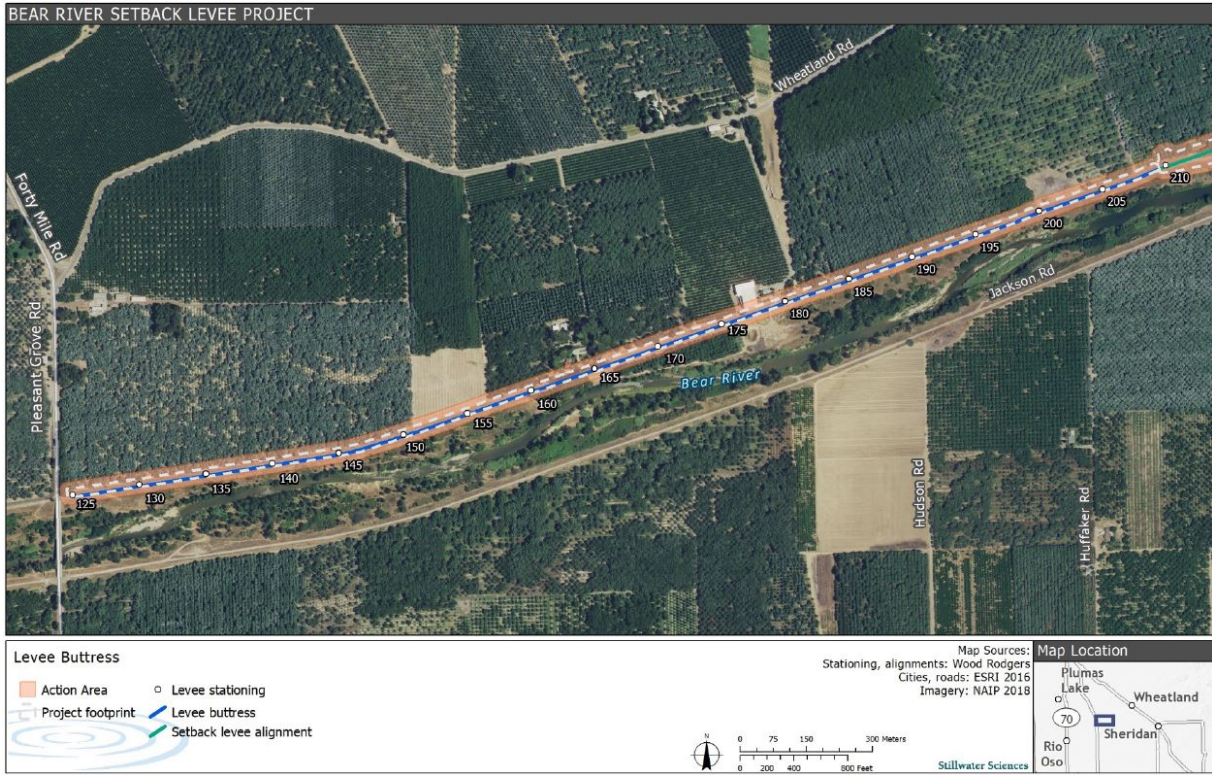
3) Action Area Map #2