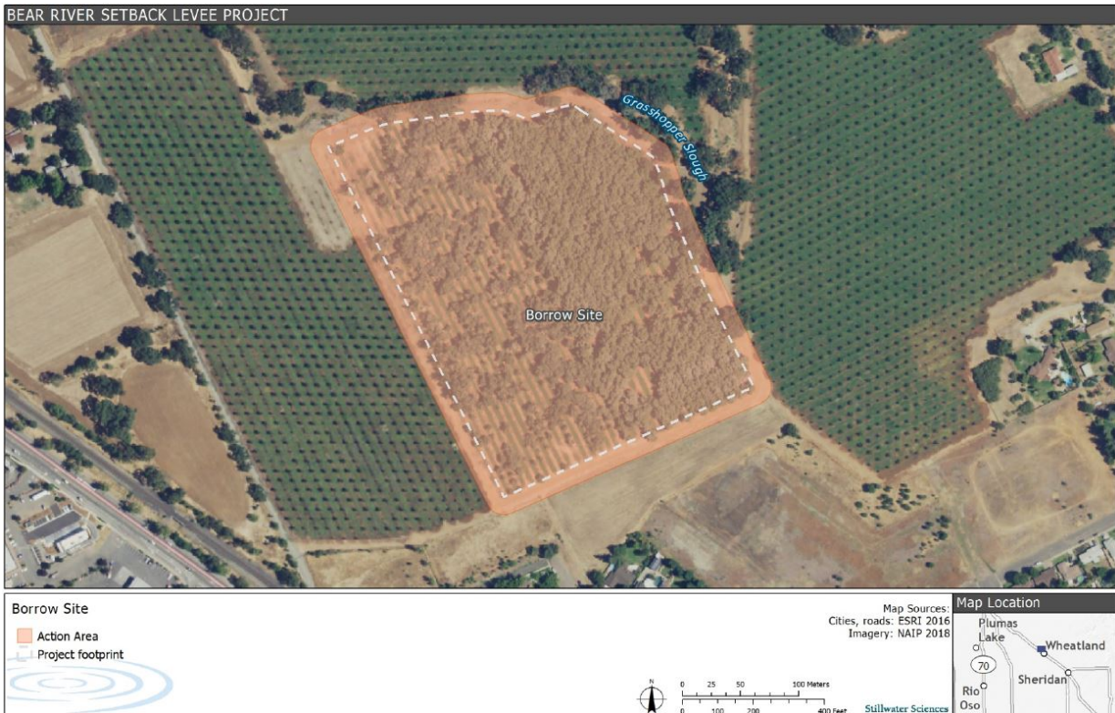
4) Borrow Area Map