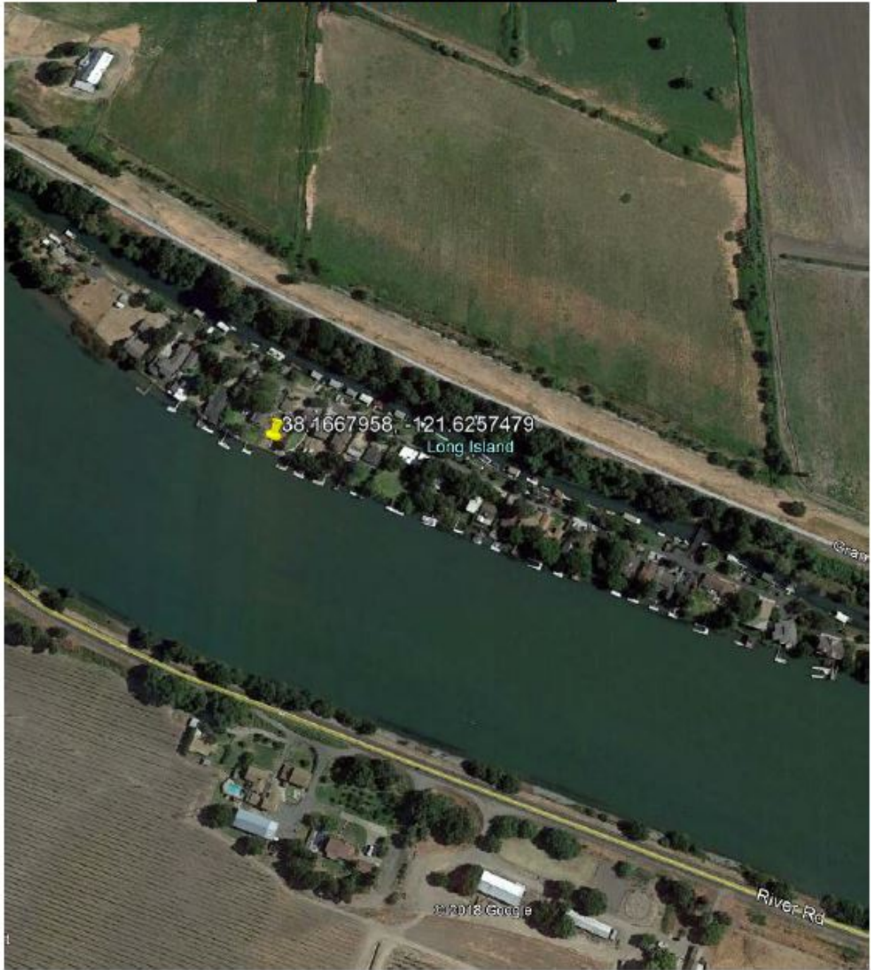
2) Proposed location map