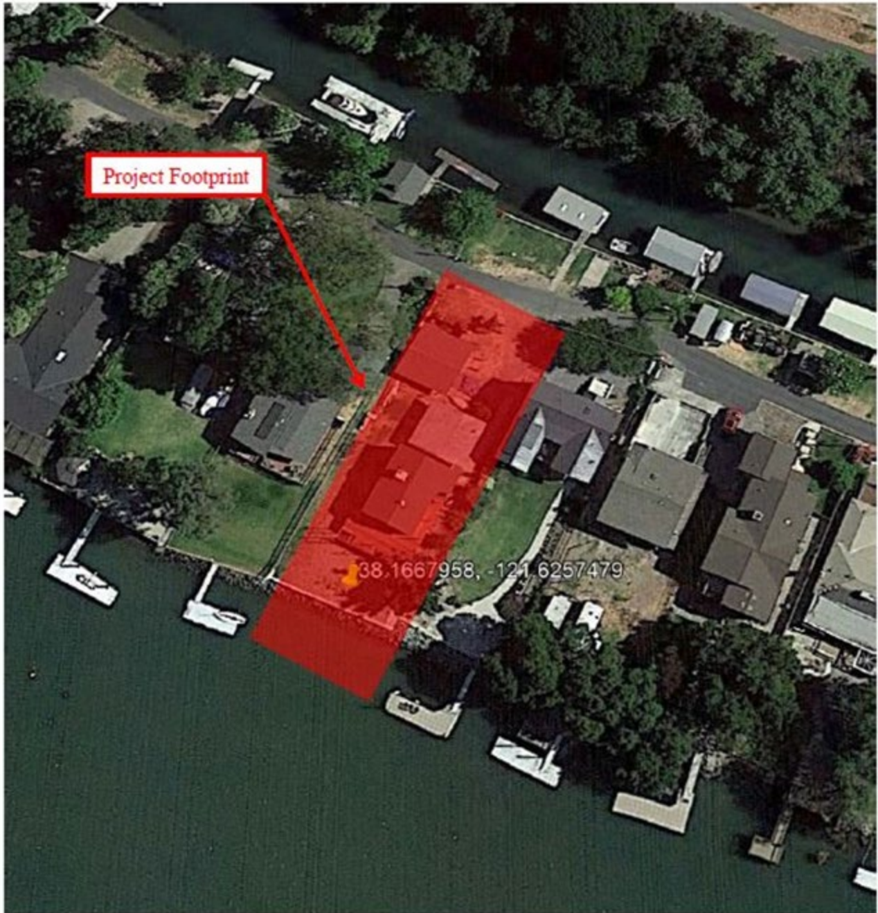
3) Proposed project footprint map