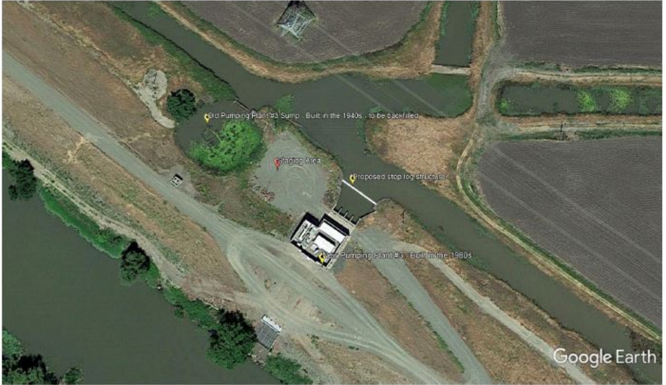
3) Approximate project footprint map (Pumping Plant 3)