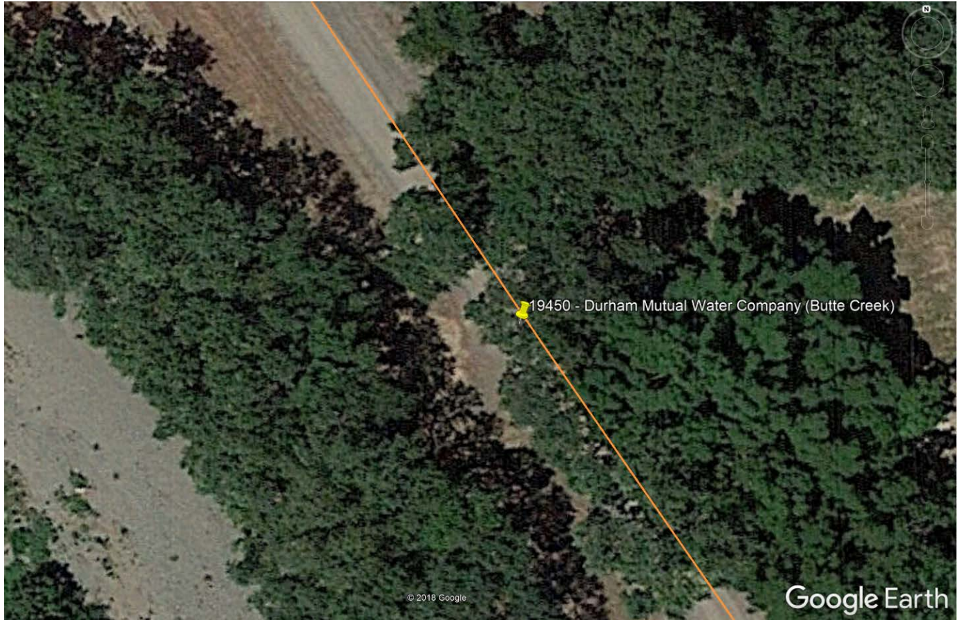
Attachment 2. Site location map