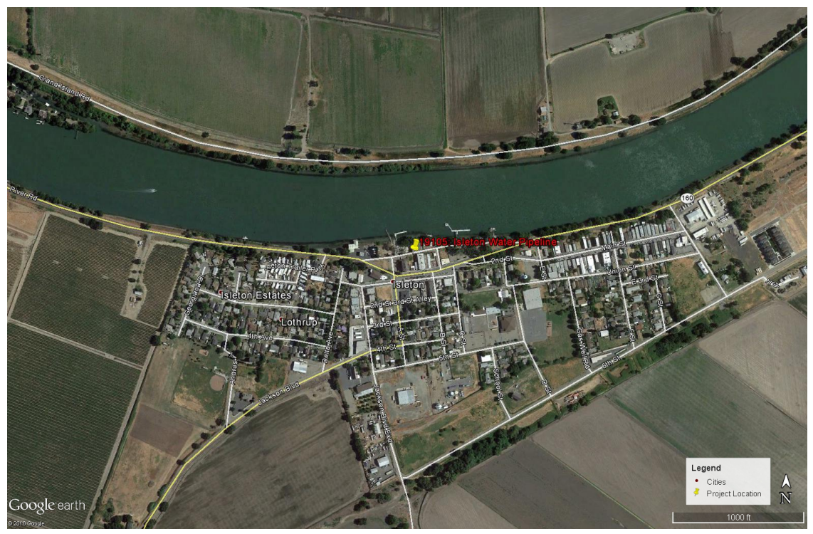
Figure 2. Proposed project location map.