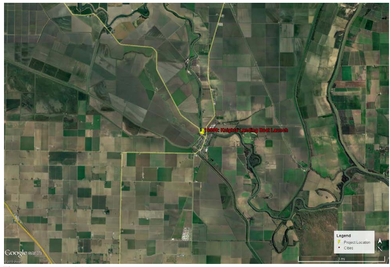
Figure 1. 18598 vicinity map.