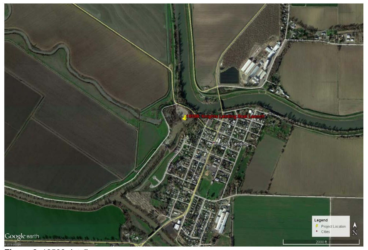
Figure 2. 18598 detail map.