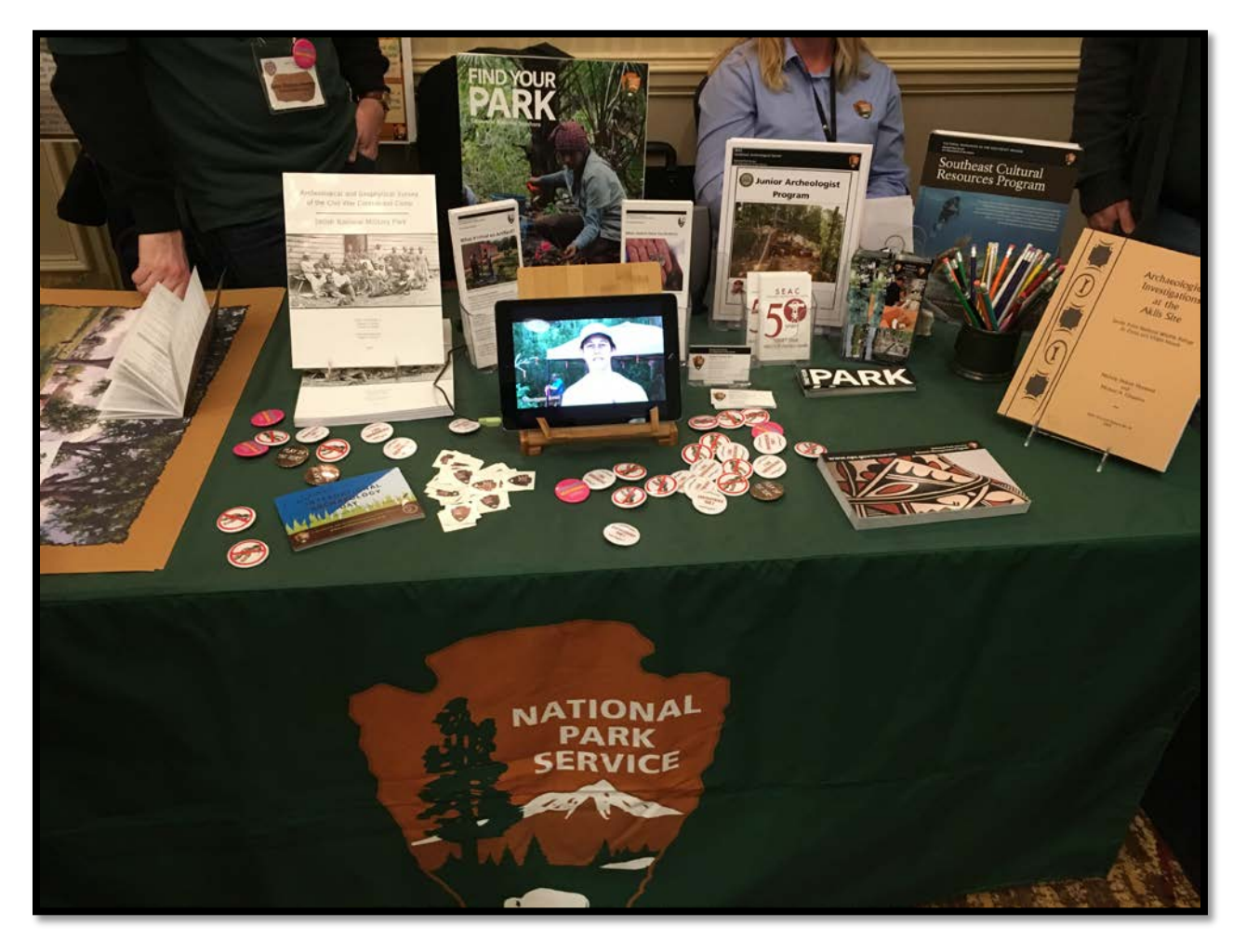
National Park Service Outreach booth at the Southeastern Archaeological Conference

TNTCX Staff attended the Southeastern Archaeological Conference in Augusta, Georgia. Tribal panels were held with the Muscogee Creek, Eastern Band of Cherokee, United Keetoowah Band, and the Chickasaw Nation to discuss topics of consultation under Section 106 of the National Historic Preservation Act and Agency partnerships. This is the first time these tribes have officially had a delegation to Augusta, Georgia since the Treaty of Augusta in 1773. Other agencies were also in attendance such as the National Park Service (Booth pictured below) and US Forest Service.