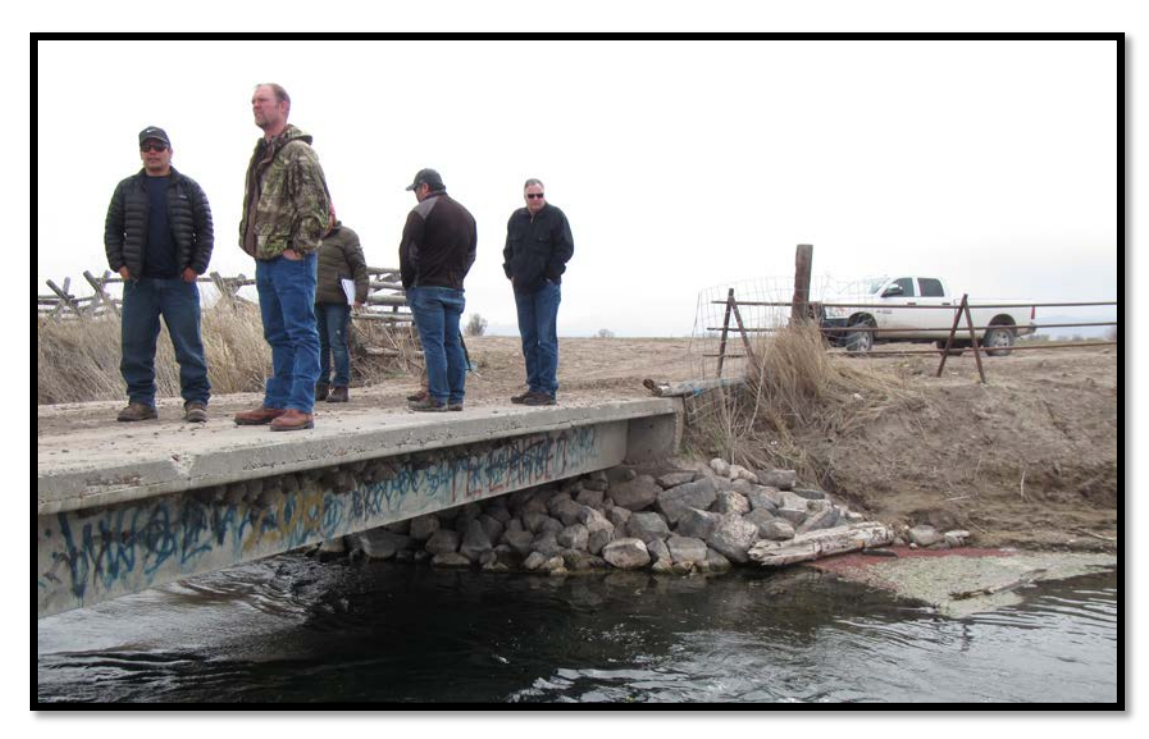
USACE staff looks at bridge riprap with tribal members

The Fort Hall Bottoms RMP will assist the Shoshone-Bannock Tribes by generating a resource inventory of biological resources, land use, cultural resources, soils, hydraulics and hydrology, water quality, and potential resource improvement projects that can be developed, within the bottoms area, to enhance their water and land use resources for future development and cultural usage.