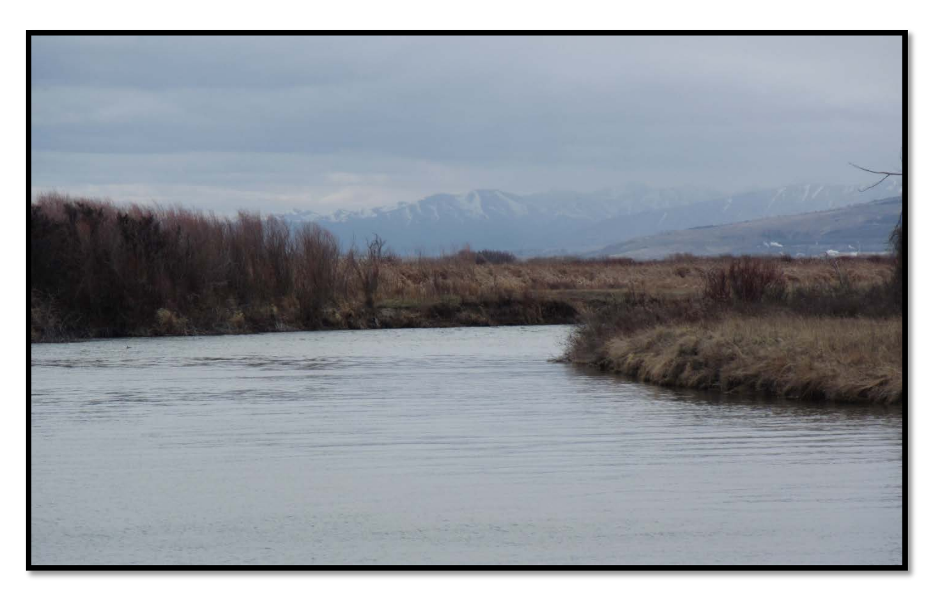
View of Snake River with Mountains in the background

The Tribes generally subsisted as hunters and gatherers, traveling during the spring and summer seasons, collecting foods for use during the winter months. They hunted wild game, fished the region's abundant and bountiful streams and rivers (primarily for salmon), and collected native plants and roots such as the camas bulb. Buffalo served as the most significant source of food and raw material for the tribes." ( Shoshone-Bannock Tribes website, November 9, 2018. <u>http://www2.sbtribes.com/about/</u>)