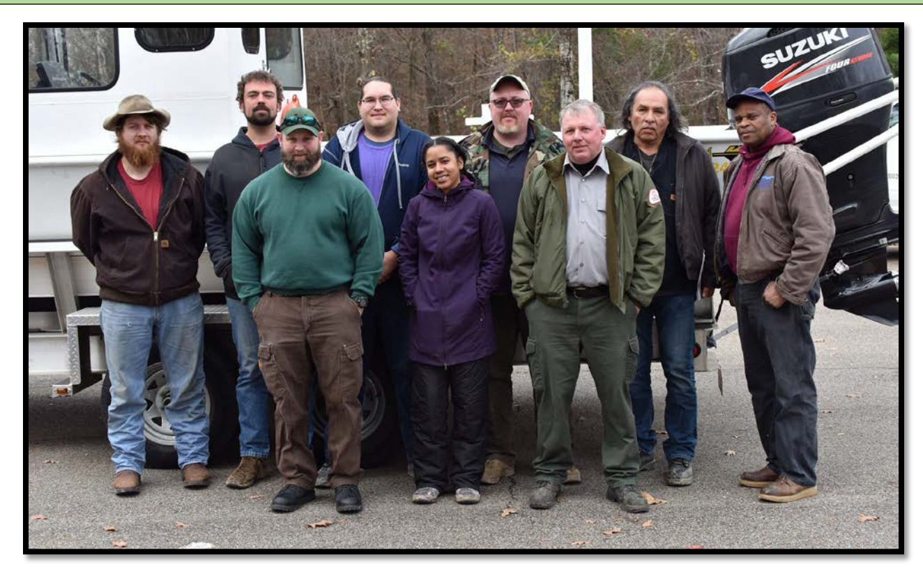
USACE Mobile District partners with Choctaw Nation of Oklahoma for Ancestral Plant Gathering on the Tennessee-Tombigbee Waterway