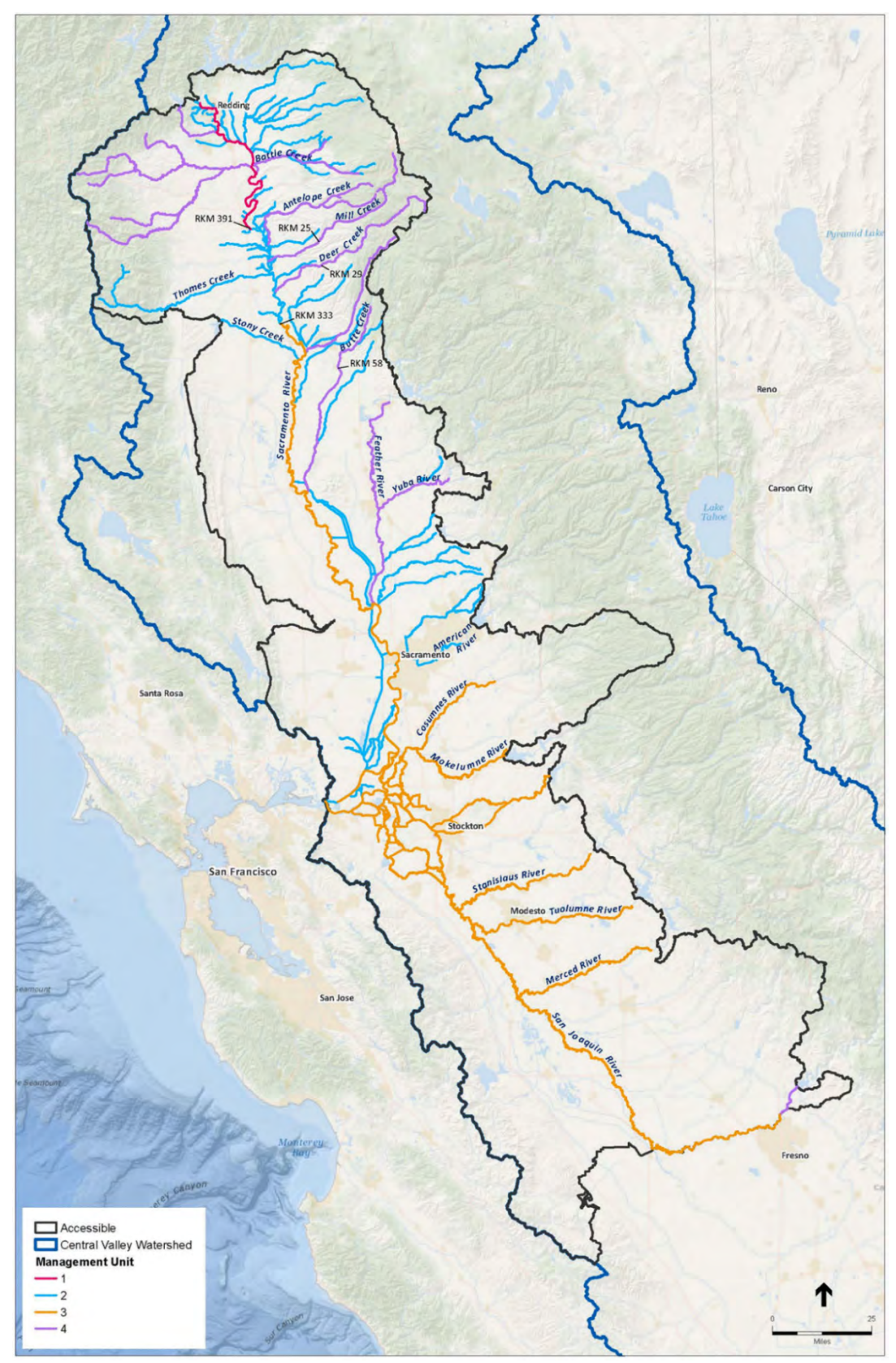
Figure 1-1: Central Valley Management Units (MUs)