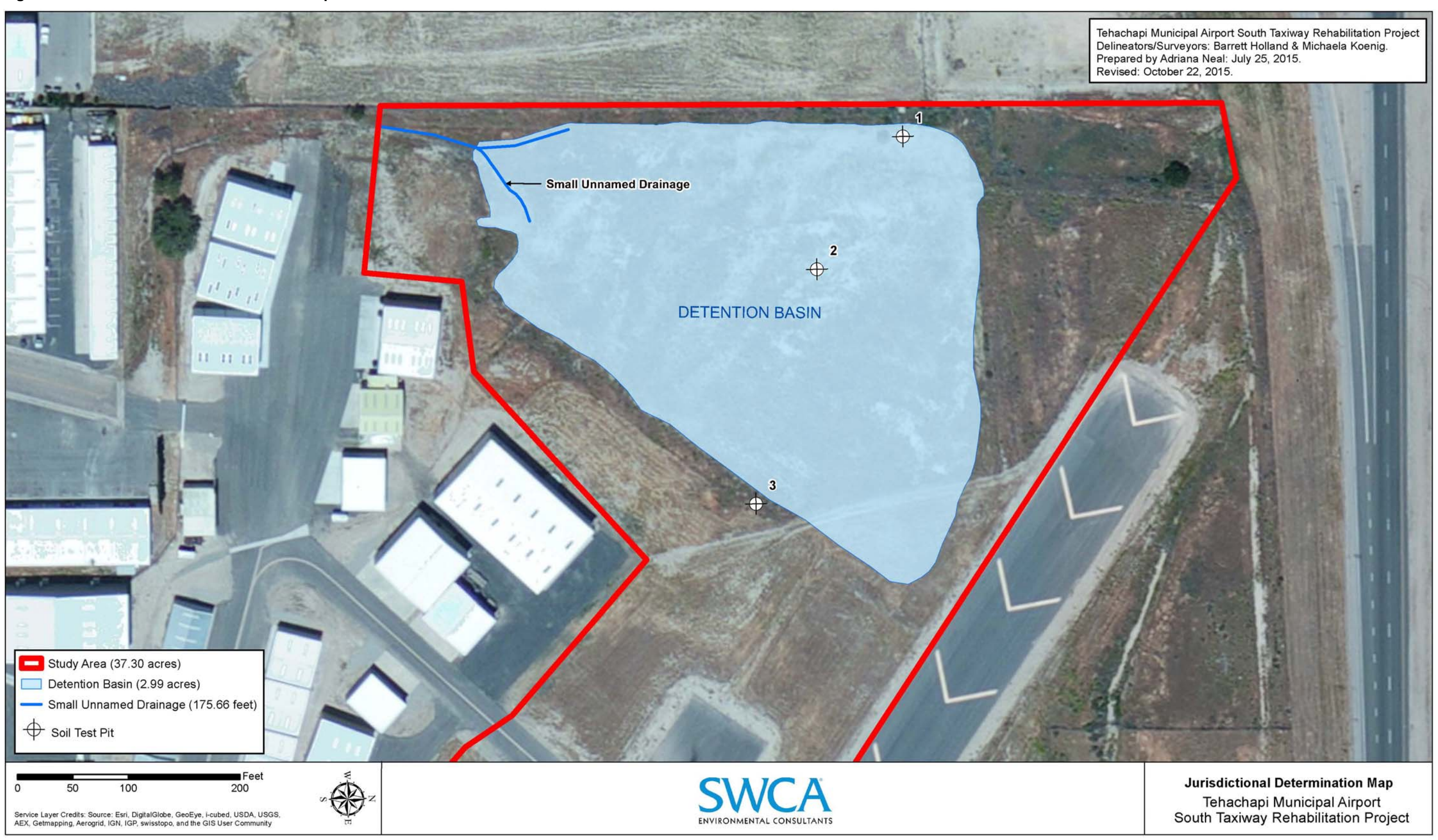
Figure 5. Jurisdictional Waters Delineation Map