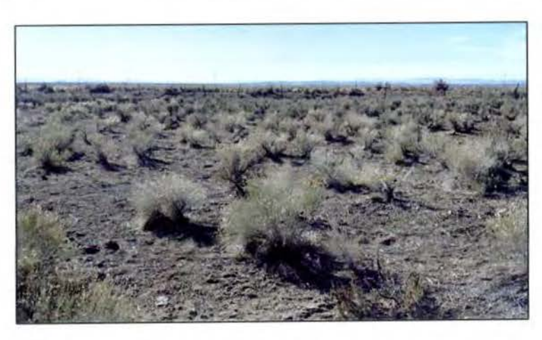
Photo Point 7 on Figure 2 looking downgradient where the Duggins Creek USGS map shows a blue line, indicating that a drainage exists here. No OHWM or other indication of channelized or ponded water was noted here.

Photo Point 7 on Figure 2 looking upgradient where the Duggins Creek USGS map shows a blue line, indicating that a drainage exists here. No OHWM or other indication of channelized or ponded water was noted here.