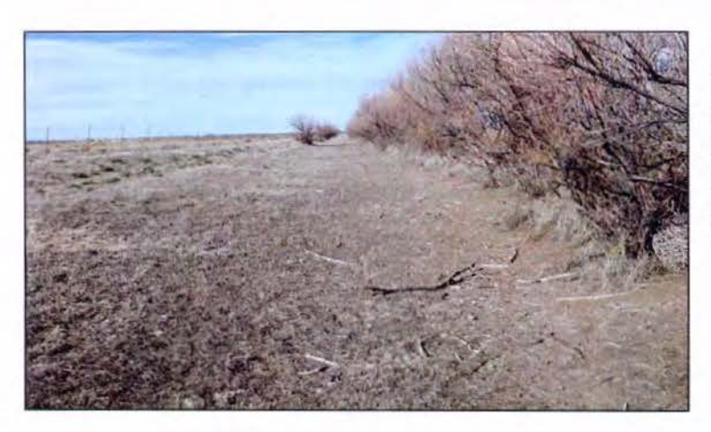
Photo Point 9 on Figure 2. This is the canal, looking upgradient, and is almost completely blown in with sand. The trees on the right are tamarisk. Cheatgrass is thick at the base of the tamarisks. No OHWM or other indication of channelized or ponding water was noted here.

Photo Point 8 on Figure 2 looking downgradient where the Duggins Creek USGS map shows a blue line, indicating that a drainage exists here. No OHWM or other indication of channelized or ponded water was noted here. The road in the middle ground is the north boundary of the proposed project area.