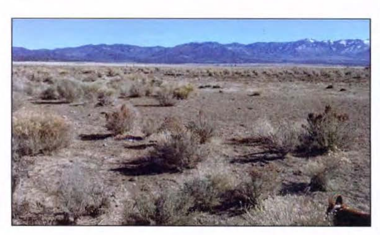
Photo Point 3A on Figure 2, looking upgradient. This area was not marked as a drainage but in the field looked to be at a lower elevation and more open than Point 3. However, no OHWM or other indicators were observed here.

Photo Point 3 on Figure 2, looking at surface conditions: there is no indication of water movement or ponding in the area.