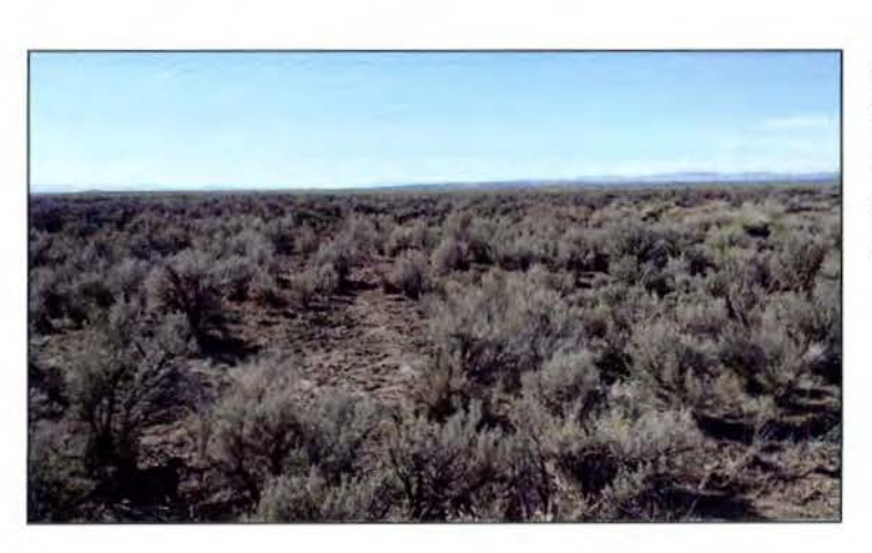
Photo Point 4 on Figure 2, looking downgradient where the Duggins Creek USGS map shows a blue line, indicating that a drainage exists here. No OHWM or other indication of channelized or ponded water was noted here

Photo Point 4 on Figure 2, looking upgradient where the Duggins Creek USGS map shows a blue line, indicating that a drainage exists here. No OHWM or other indication of channelized or ponded water was noted here.