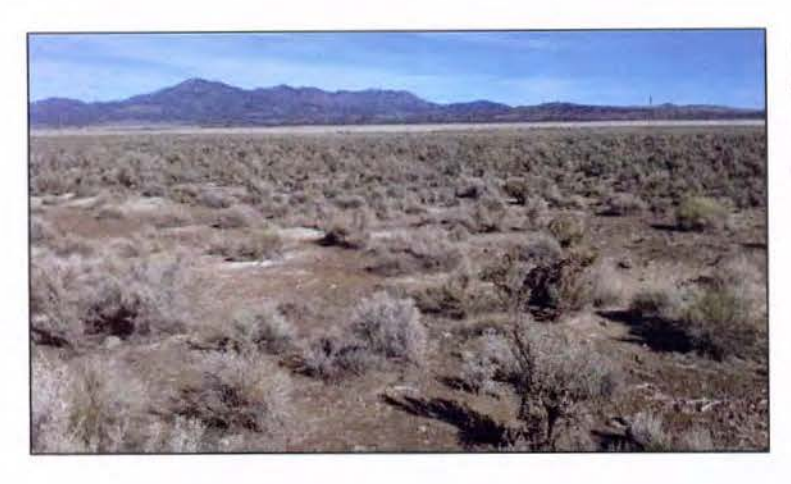
Photo Point 5 on Figure 2, looking upgradient where the Duggins Creek USGS map shows a blue line, indicating that a drainage exists here. No OHWM or other indication of channelized or ponded water was noted here.

Photo Point 4 on Figure 2 showing ground conditions and lack of signs of water flow or ponding. Dog is about 16 inches high.