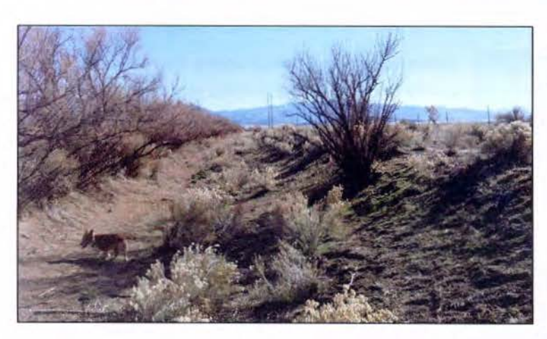
Photo Point 9 on Figure 2; canal, looking downgradient. Lounging cattle have made the canal bottom flat where dog is.

Photo Point 9 on Figure 2. This is the canal, looking upgradient, and is almost completely blown in with sand. The trees on the right are tamarisk. Cheatgrass is thick at the base of the tamarisks. No OHWM or other indication of channelized or ponding water was noted here.