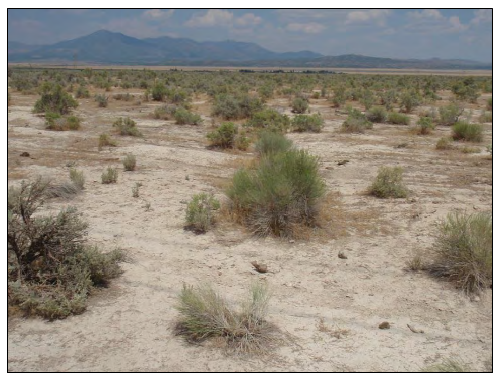
Figure B4. Looking east along flow path 2 at P05.