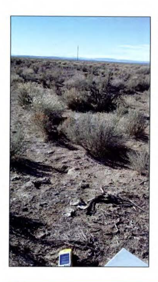
Photo Point 3A looking downgradient and at the ground surface. No OHWM or other indicators were observed here.