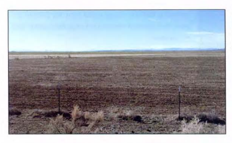
Photo Point 5 on Figure 2 looking downgradient at agricultural field. The lack of an OHWM, channel, or other indication of water movement is very clear in this photo.

Photo Point 5 on Figure 2, looking upgradient where the Duggins Creek USGS map shows a blue line, indicating that a drainage exists here. No OHWM or other indication of channelized or ponded water was noted here.