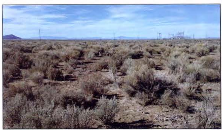
Photo Point 3 on Figure 2, looking downgradient where the Duggins Creek USGS map shows a blue line, indicating that a drainage exists here. No OHWM or other indication of channelized or ponded water was noted here.

Photo Point 3 on Figure 2, looking upgradient where the Duggins Creek USGS map shows a blue line, indicating that a drainage exists here. No OHWM or other indication of channelized or ponded water was noted here.