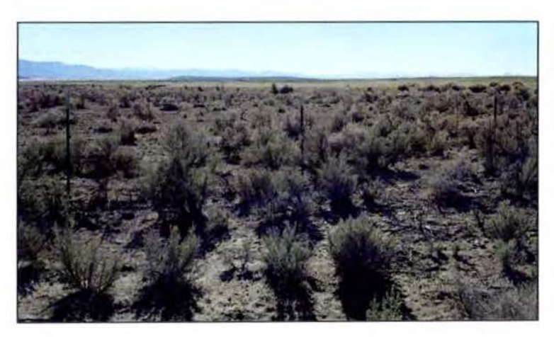
Photo Point 6 on Figure 2 looking downgradient where the Duggins Creek USGS map shows a blue line, indicating that a drainage exists here. No OHWM or other indication of channelized or ponded water was noted here.

Photo Point 6 on Figure 2 looking upgradient where the Duggins Creek USGS map shows a blue line, indicating that a drainage exists here. No OHWM or other indication of channelized or ponded water was noted here.