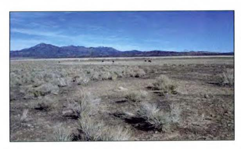
Photo Point 7 on Figure 2 looking upgradient where the Duggins Creek USGS map shows a blue line, indicating that a drainage exists here. No OHWM or other indication of channelized or ponded water was noted here.

Photo Point 6 on Figure 2 looking downgradient where the Duggins Creek USGS map shows a blue line, indicating that a drainage exists here. No OHWM or other indication of channelized or ponded water was noted here.