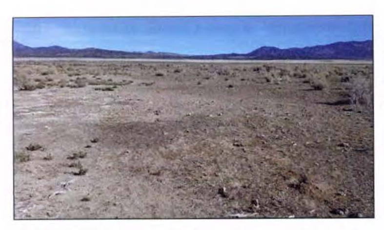
Photo Point 3 on Figure 2, looking upgradient where the Duggins Creek USGS map shows a blue line, indicating that a drainage exists here. No OHWM or other indication of channelized or ponded water was noted here.