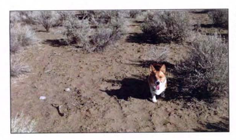
Photo Point 4 on Figure 2 showing ground conditions and lack of signs of water flow or ponding. Dog is about 16 inches high.