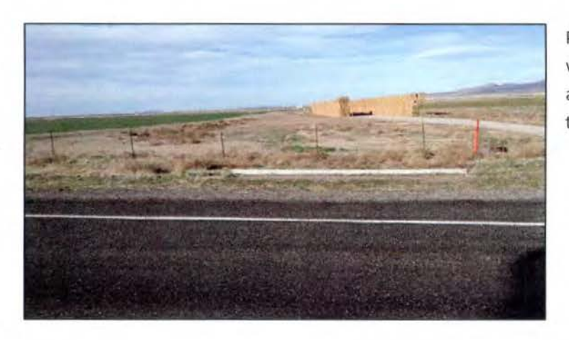
Photo Point 10 on Figure 2 looking upgradient. This is where the canal is supposed to cross the road. There are vague remnants of the canal in the brushy area to the left and in front of the haystacks.