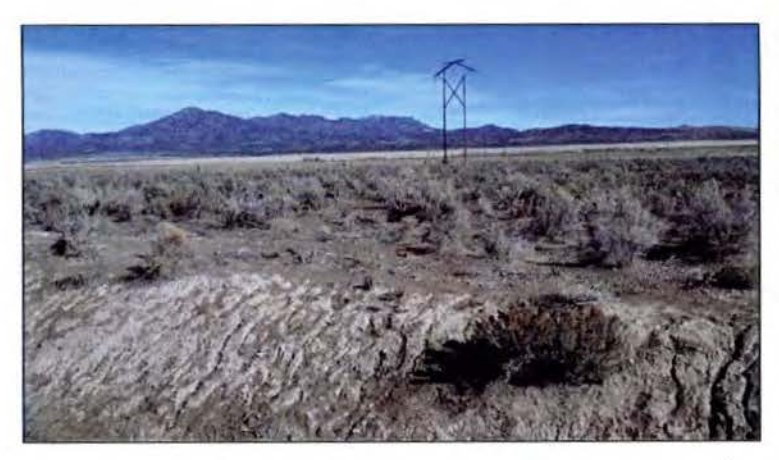
Photo Point 1 on Figure 2, looking upgradient where the Duggins Creek USGS map shows a blue line, indicating that a drainage exists here. No OHWM or other indication of channelized or ponded water was noted here or in the canal, the edge of which is visible at the whitish, eroded slope.