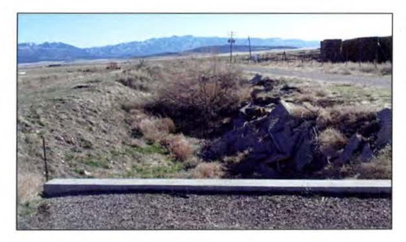
Photo Point 10 on figure 2 looking downgradient. The canal is obvious in this photo, although it is also filled in with brush and grasses, indicating that the canal has not been used for some time.

Photo Point 10 on Figure 2 looking upgradient. This is where the canal is supposed to cross the road. There are vague remnants of the canal in the brushy area to the left and in front of the haystacks.