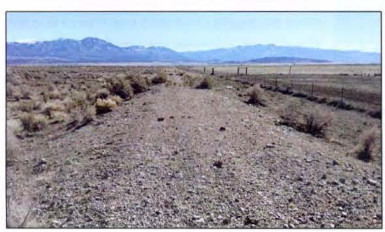
Photo Point 5 on Figure 2 looking southeast from top of old railroad grade. This grade acts as a dam that prevents water flowing off of the proposed project area from reaching down-gradient fields.

Photo Point 5 on Figure 2 looking downgradient at agricultural field. The lack of an OHWM, channel, or other indication of water movement is very clear in this photo.