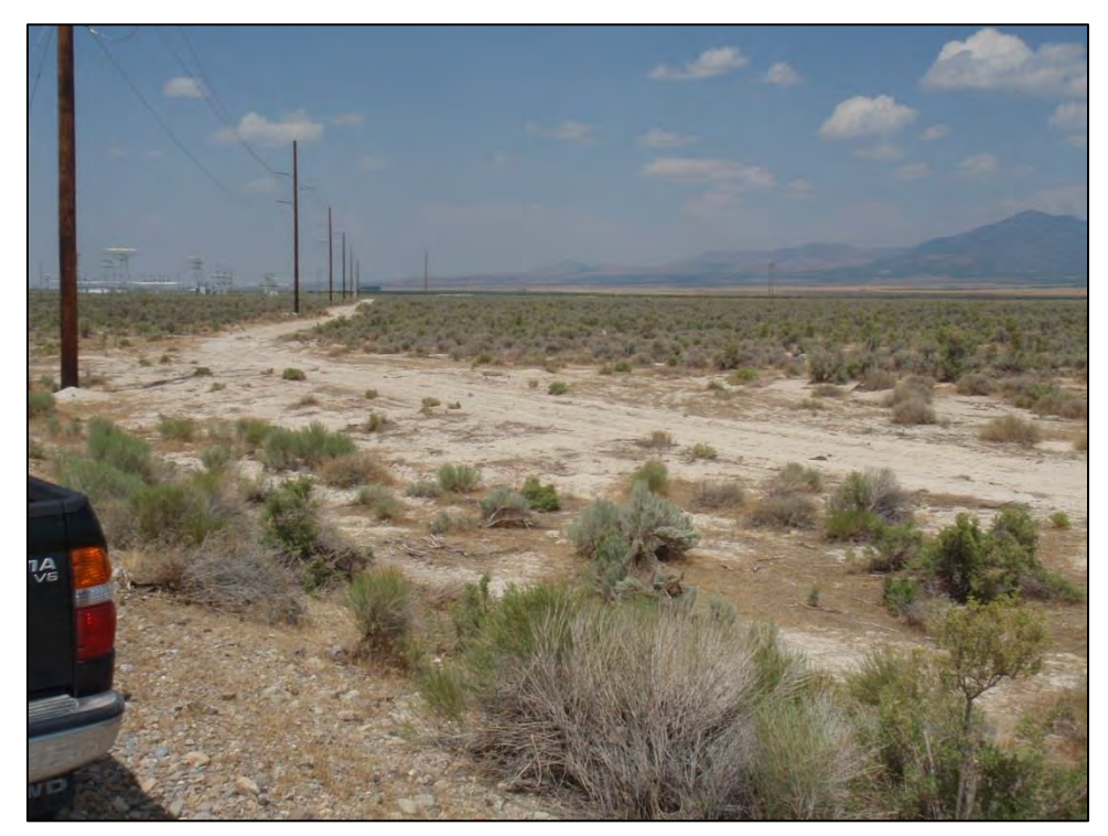
Figure B1. Overview of the study area.