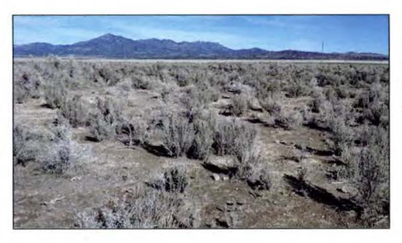
Photo Point 6 on Figure 2 looking upgradient where the Duggins Creek USGS map shows a blue line, indicating that a drainage exists here. No OHWM or other indication of channelized or ponded water was noted here.