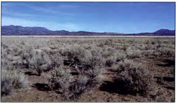
Photo Point 4 on Figure 2, looking upgradient where the Duggins Creek USGS map shows a blue line, indicating that a drainage exists here. No OHWM or other indication of channelized or ponded water was noted here.

Photo Point 3A looking downgradient and at the ground surface. No OHWM or other indicators were observed here.