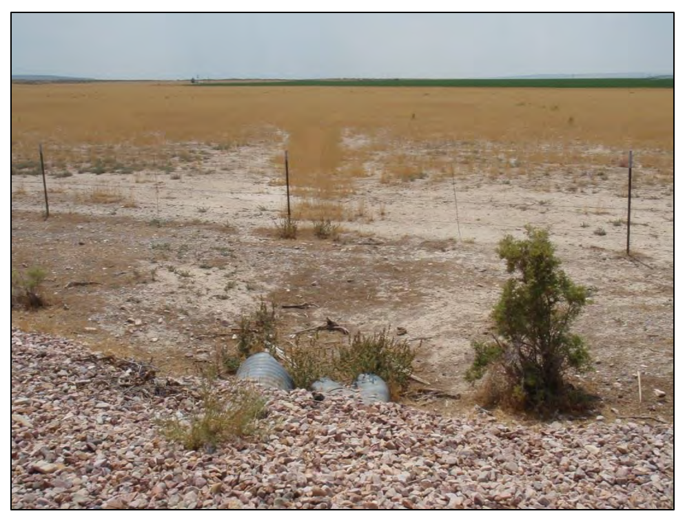
Figure B5. Looking west at culverts along flow path 2 at P05.