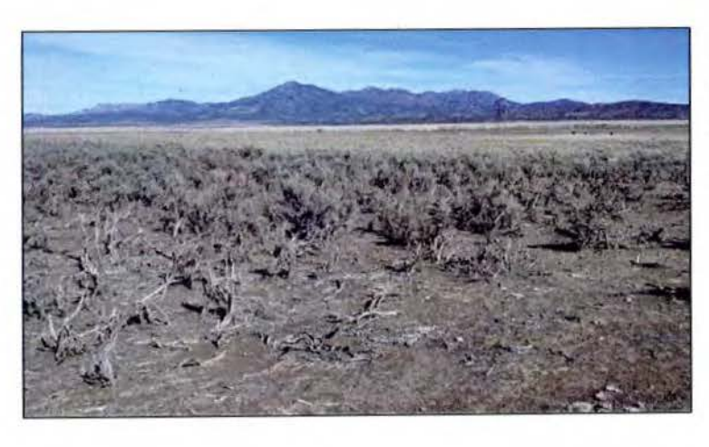
Photo Point 2 on Figure 2, looking upgradient where the Duggins Creek USGS map shows a blue line, indicating that a drainage exists here. No OHWM or other indication of channelized or ponded water was noted here.

Photo Point 1 on Figure 2, looking downgradient where the Duggins Creek USGS map shows a blue line, indicating that a drainage exists here. No OHWM or other indication of channelized or ponded water was noted here.