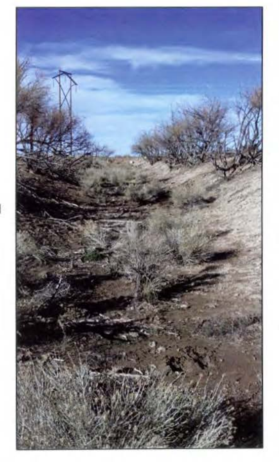
Photo Point 1 on Figure 2, looking upgradient at old Central Utah Canal. No OHWM or other indication of channelized or ponded water was noted here.

Photo Point 10 on figure 2 looking downgradient. The canal is obvious in this photo, although it is also filled in with brush and grasses, indicating that the canal has not been used for some time.