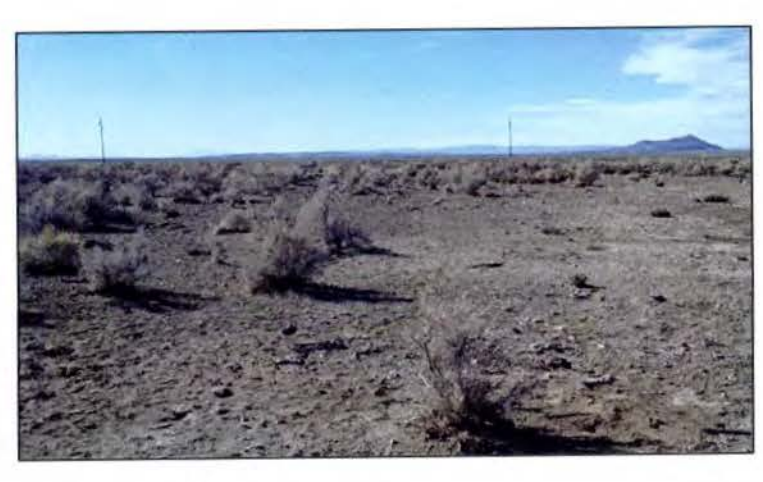
Photo Point 2 on Figure 2, looking downgradient where the Duggins Creek USGS map shows a blue line, indicating that a drainage exists here. No OHWM or other indication of channelized or ponded water was noted here.

Photo Point 2 on Figure 2, looking upgradient where the Duggins Creek USGS map shows a blue line, indicating that a drainage exists here. No OHWM or other indication of channelized or ponded water was noted here.