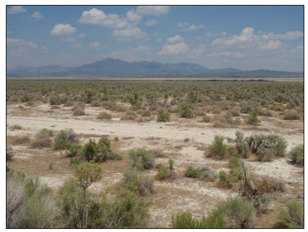
Figure B3. View east along flow path 1 at P06.