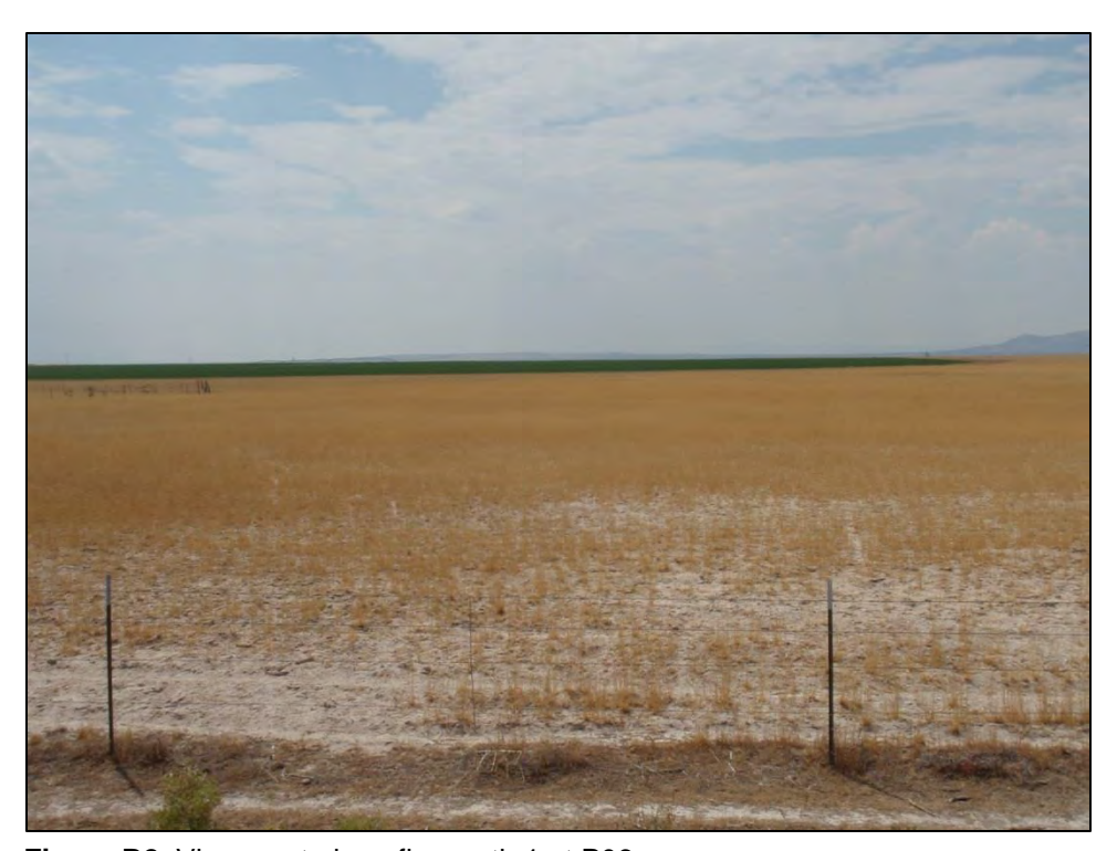
Figure B2. View west along flow path 1 at P06.