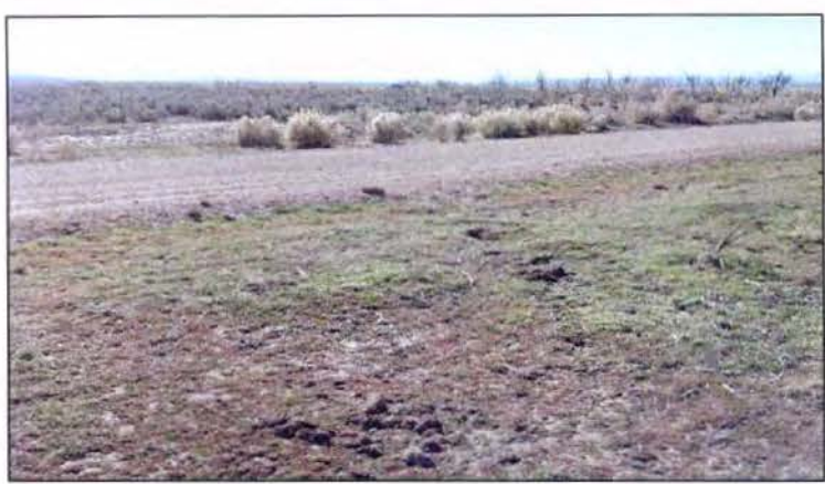
Photo Point 8 on Figure 2 looking downgradient where the Duggins Creek USGS map shows a blue line, indicating that a drainage exists here. No OHWM or other indication of channelized or ponded water was noted here. The road in the middle ground is the north boundary of the proposed project area.

Photo Point 8 on Figure 2 looking upgradient where the Duggins Creek USGS map shows a blue line, indicating that a drainage exists here. No OHWM or other indication of channelized or ponded water was noted here.