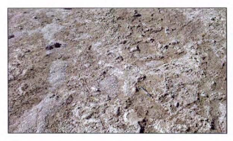
Photo Point 3 on Figure 2, looking at surface conditions: there is no indication of water movement or ponding in the area.

Photo Point 3 on Figure 2, looking downgradient where the Duggins Creek USGS map shows a blue line, indicating that a drainage exists here. No OHWM or other indication of channelized or ponded water was noted here.