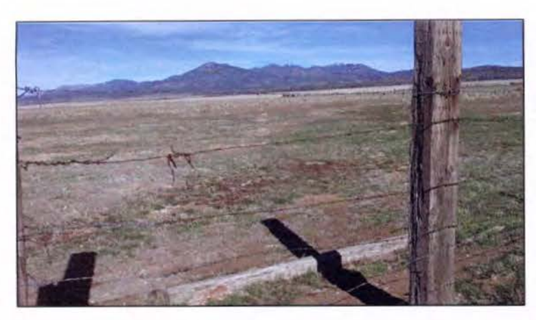
Photo Point 8 on Figure 2 looking upgradient where the Duggins Creek USGS map shows a blue line, indicating that a drainage exists here. No OHWM or other indication of channelized or ponded water was noted here.