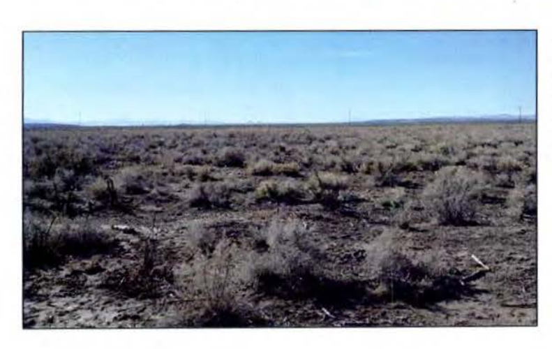
Photo Point 1 on Figure 2, looking downgradient where the Duggins Creek USGS map shows a blue line, indicating that a drainage exists here. No OHWM or other indication of channelized or ponded water was noted here.

Photo Point 1 on Figure 2, looking upgradient where the Duggins Creek USGS map shows a blue line, indicating that a drainage exists here. No OHWM or other indication of channelized or ponded water was noted here or in the canal, the edge of which is visible at the whitish, eroded slope.