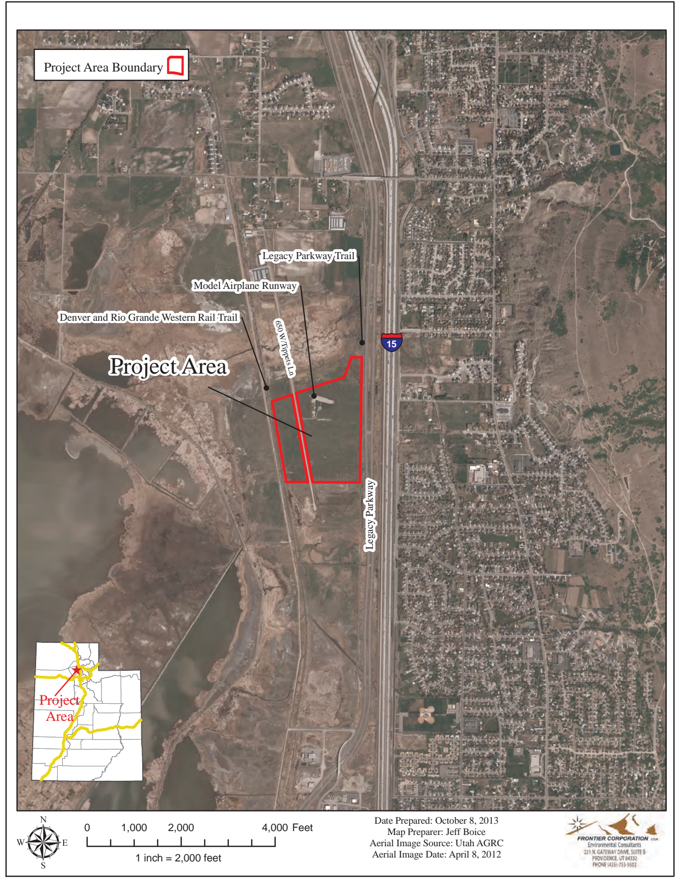
Figure 2b. Site Vicinity Map - Aerial base.