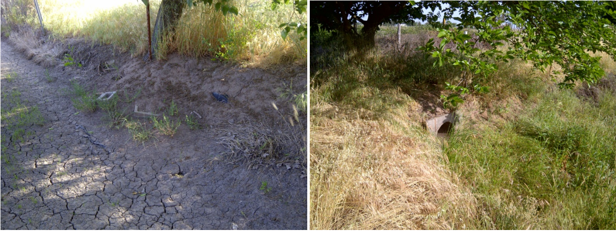
Photo 1 – The covered culvert connecting from the ditch to the pond. The very top of the plastic covering is visible in the photo.

Site visit photos taken on May 15, 2012, by Zachary Simmons