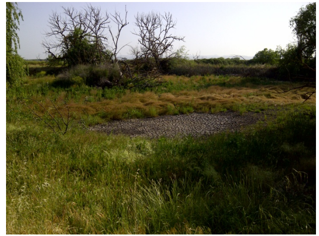
Photo 3 – The remnant pond was dry during the May 15, 2012, site visit.