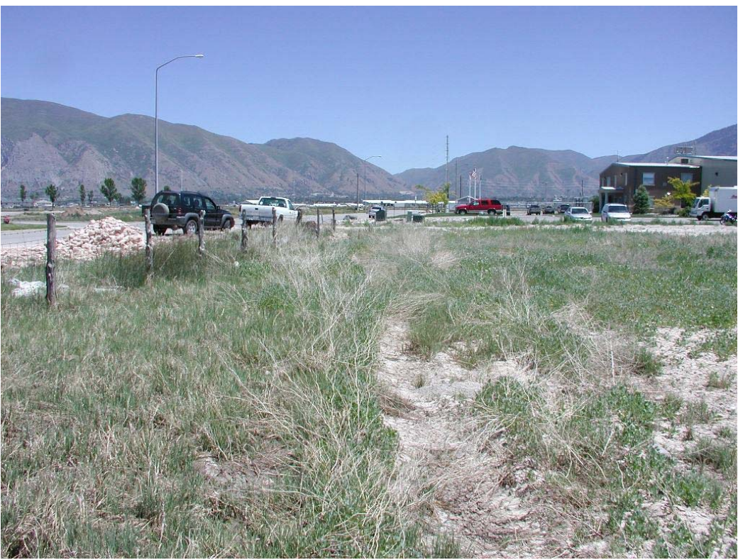
W10 (isolate) – Looking east along 3000 North Street. The eastern wetland boundary is located near the darker stand of juncus along the fence. The nearest connection to a RPW is the catch basin located approximately 50 feet in front of the white truck.