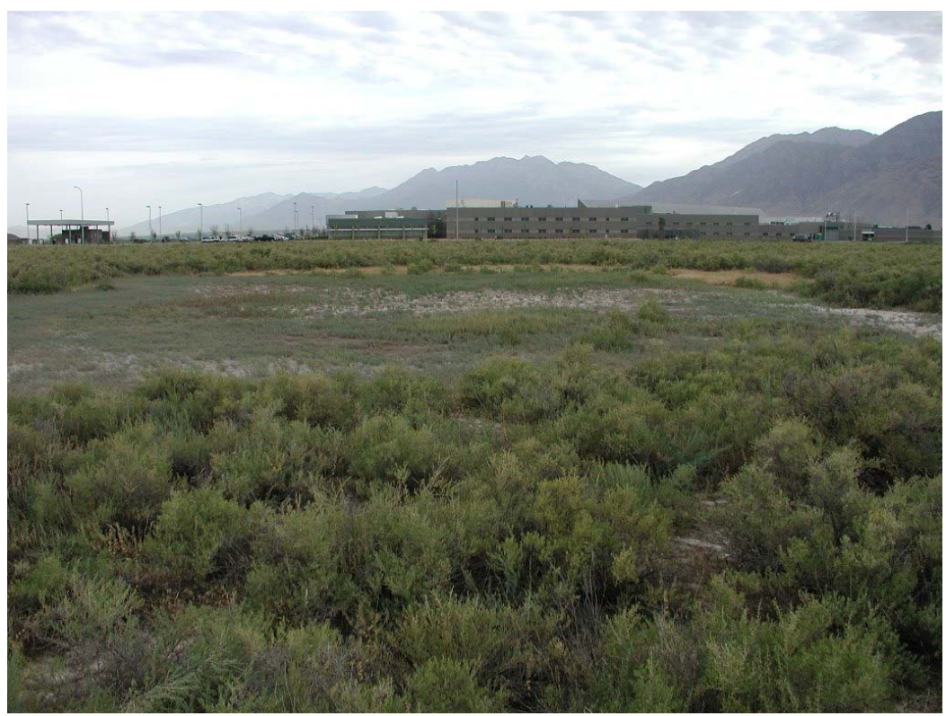
W9 (Isolate) – South end looking north. Depressed area surrounded by greasewood and cheatgrass. If water were to overflow W9, it would travel north and pond in W10.