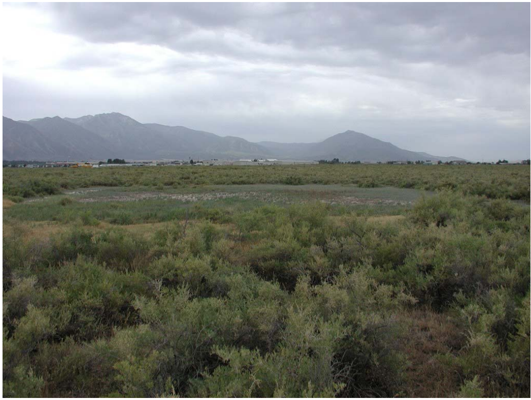
W9 (Isolate) – North end looking south toward the airport hangers.