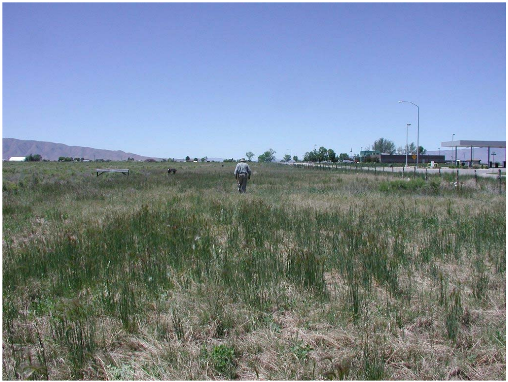
W10 (isolate) - Looking west along 3000 North Street. A portion of the airport property drains to this location and ponds creating a wet meadow. The road acts as a dam.