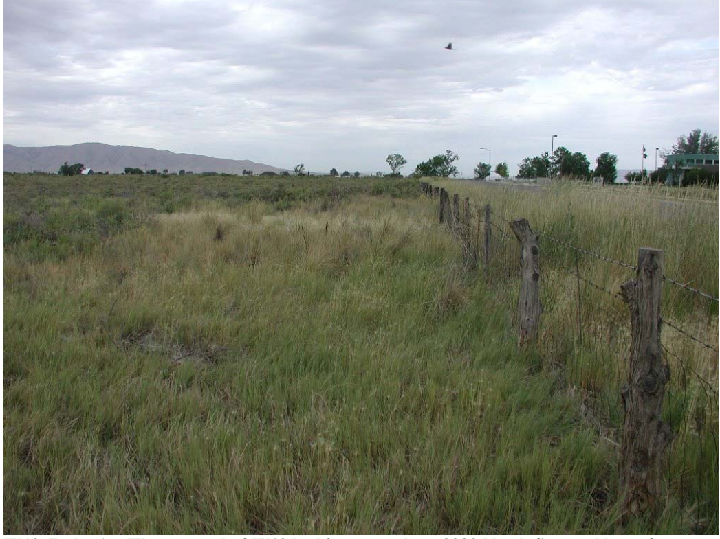
W10 (Isolate) – Western end of W10 looking west along 3000 North Street. No surface connection to a RPW can occur in a western direction due to elevation gain. No culverts occur along the roadway.