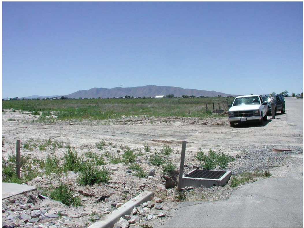
W10 (isolate) – Looking west along 3000 North Street. This catch basin is the only possible connection to a RPW. Runoff water would have to pond in W10 at least 2 feet in order to flow into the catch basin. The wetland boundary begins 6 fence posts west from the end post.