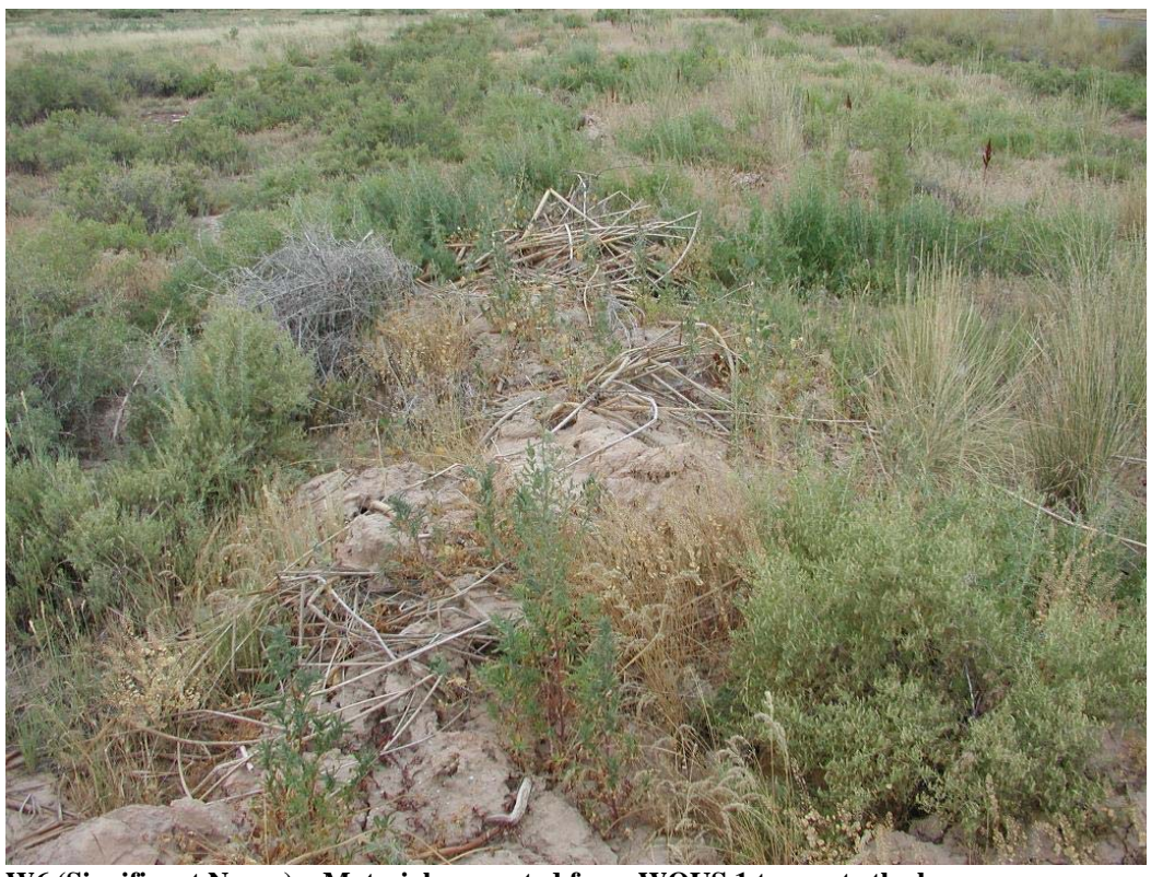
W6 (Significant Nexus) – Material excavated from WOUS 1 to create the berm.