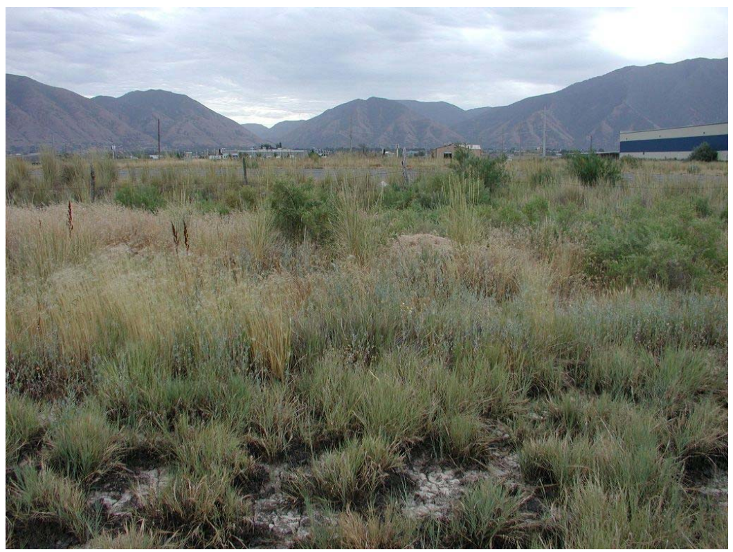
W6 (Significant Nexus) – Standing in W6 looking east across the berm, WOUS1, and Main Street.