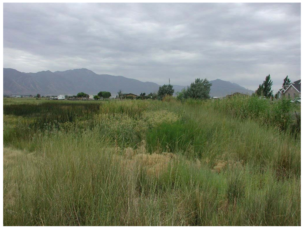
W7 (Significant Nexus) – Standing on the manmade berm between W7 (left) and WOUS3 (right) looking south. The elevation of the wetland is equivalent to the elevation of the ditch bottom. It appears material from past ditch excavations have been side cast dividing the W7 and WOUS3.