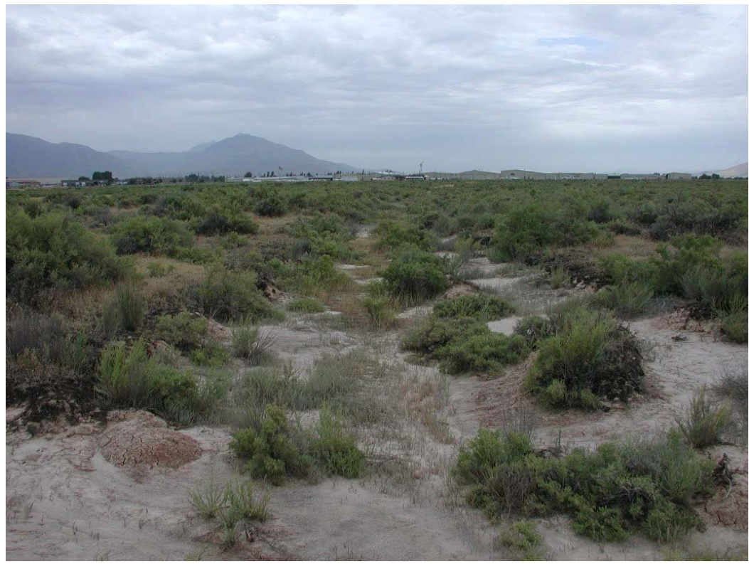
W8 (Significant Nexus) – The northern end of W8 is located approximately 300 feet up this drainage channel.