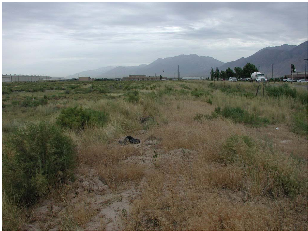
W6 (Significant Nexus) - Standing on the manmade berm between W6 (left) and WOUS1 (right) looking north.