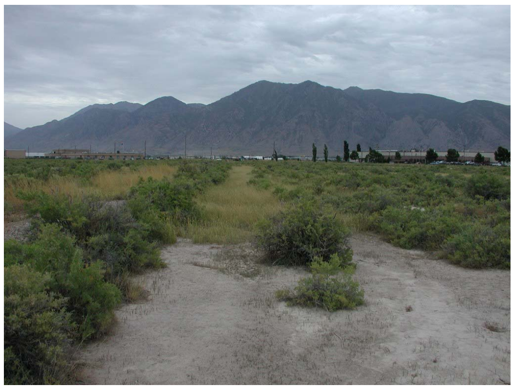
W8 (Significant Nexus) – South end of wetland looking northeast. Wetland is in a defined drainage channel that flows in a northeast direction to W2 which connects to WOUS1.