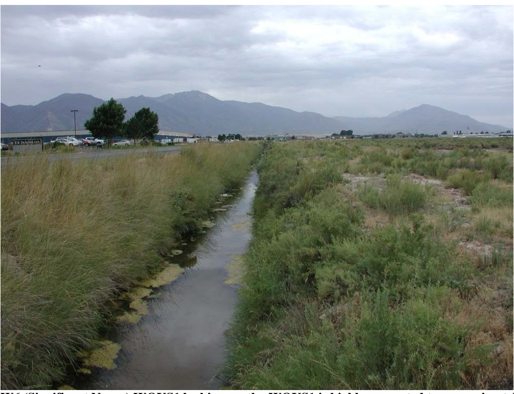
W6 (Significant Nexus) WOUS1 looking south. WOUS1 is highly excavated to approximately 6 feet with nearly vertical banks. Over the years, excavated material from the ditch has been side cast creating a berm that severed the connection between the ditch and W6.