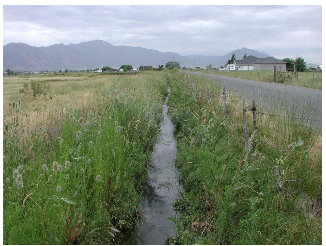
W7 (Significant nexus) – WOUS3 flowing along 800 West Street looking south. W7 is the dark patch in the distance on the left side of the ditch.