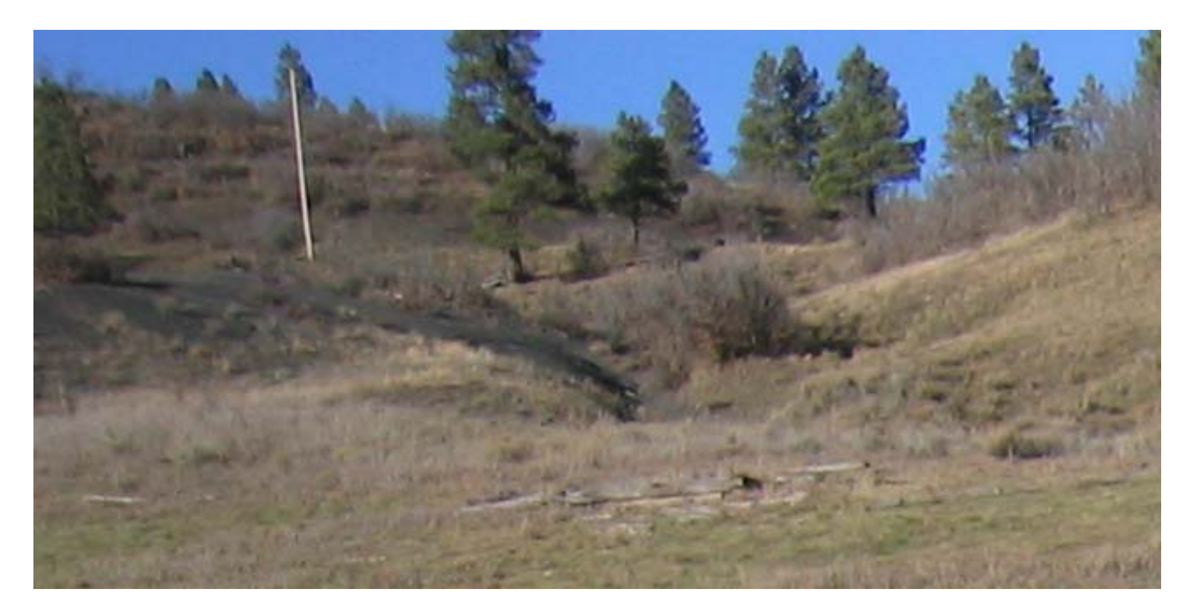
Photo 1. Looking at ephemeral wash north from Photopoint 1. Note erosive Mancos shale slopes.