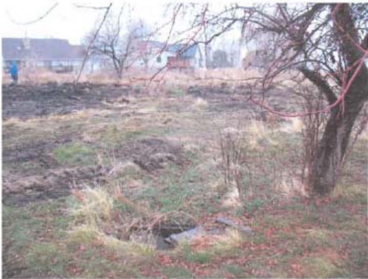
Photo 19. View of "bubble-up box" near the western project area boundary.