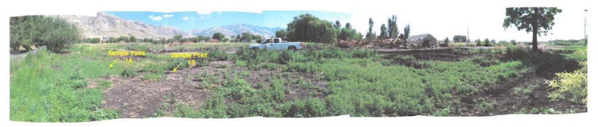
Photo 13. Panoramic view facing south from the north boundary. Wetland is to the east (July 13, 2007).