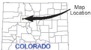
FIGURE 1. Project Location Map Lake Creek Farm Lot 3

BASE: USGS 7.5 Minute Edwards, Colorado Quadrangle Photorevised: 1987