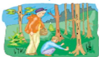
No Permit Required – Life goes on ...