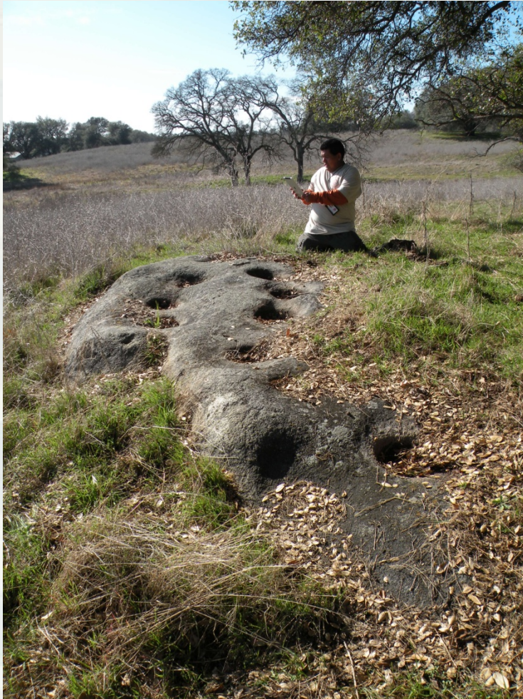
Site visit in Rocklin, CA, with United Auburn Indian Community of the Auburn Rancheria representatives