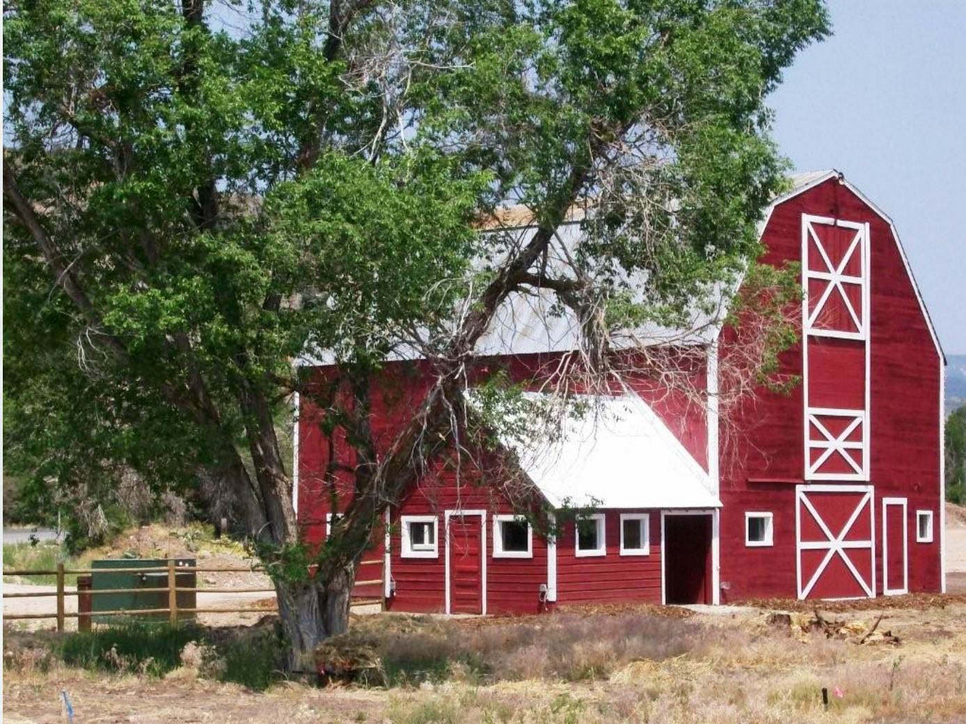
Building restoration, Victory Ranch, near Kamas, UT