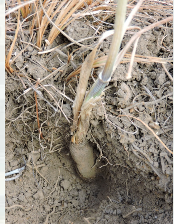
Yampa harvesting on Deadman Creek, near Inyo Craters, California.

These resources are generally documented as sites, buildings, structures, objects, or districts.