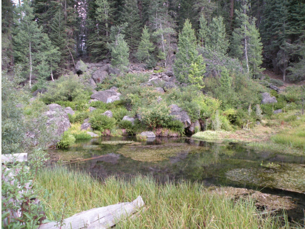
Domingo Springs, Lassen National Forest, CA “Center of the universe” for the Mountain Maidu.