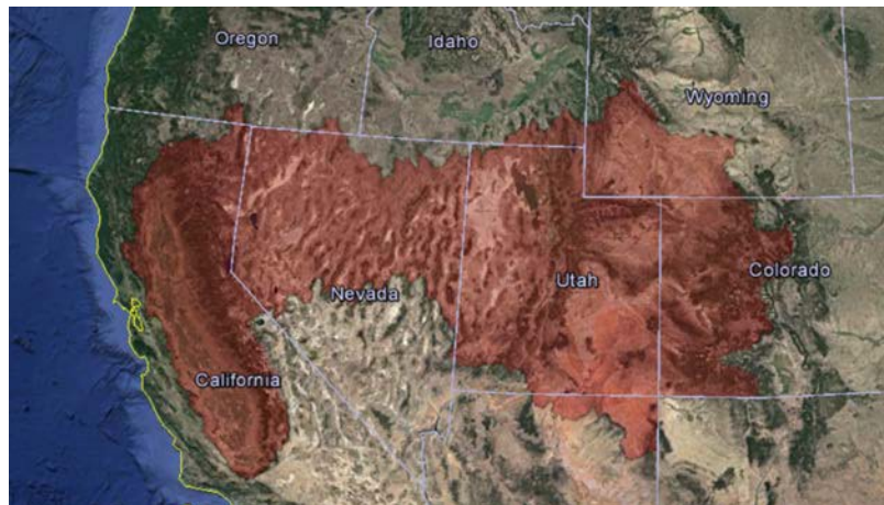
Sacramento District Boundary

This technical assistance may not include the preparation of site-specific designs or construction. Technical assistance activities through the PAS program are cost shared (50 per cent) with the study partner, and voluntarily contributed funds in excess of cost share may be provided by the non-Federal partner. The cost-share for technical assistance must be provided by funds (not in-kind). Technical assistance activities through the PAS program are cost shared (50 per cent) with the study partner, and voluntarily contributed funds in excess of cost share may be provided by the non-Federal partner. The cost-share for technical assistance must be provided by funds (not in-kind).