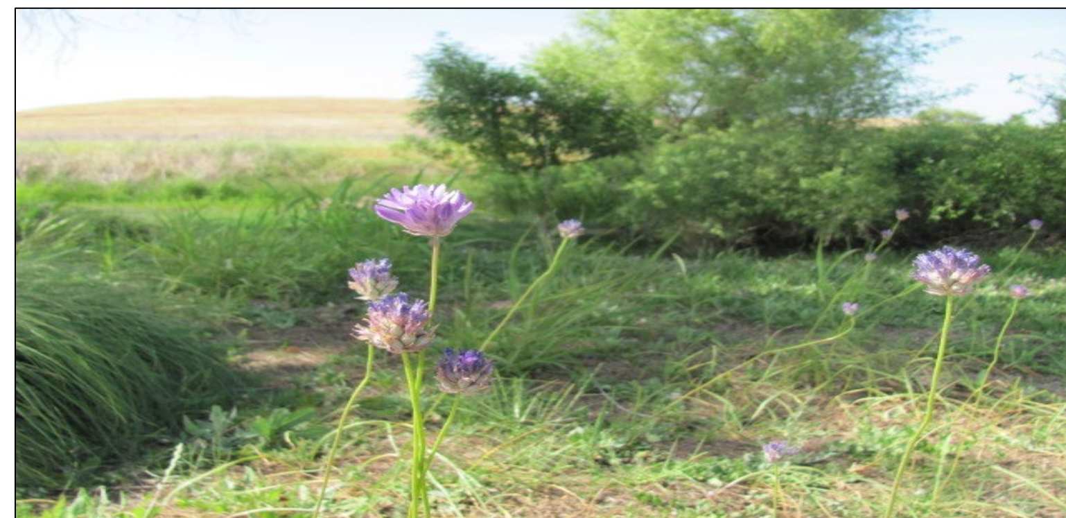
Cluster lilies ('waji') historic Tribal plant