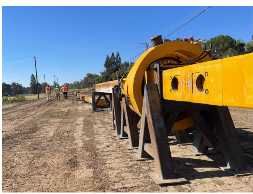
Reach A: Preparing for assembly of the CSM Rig for Cutoff Wall Demonstration Section work at Farm Road