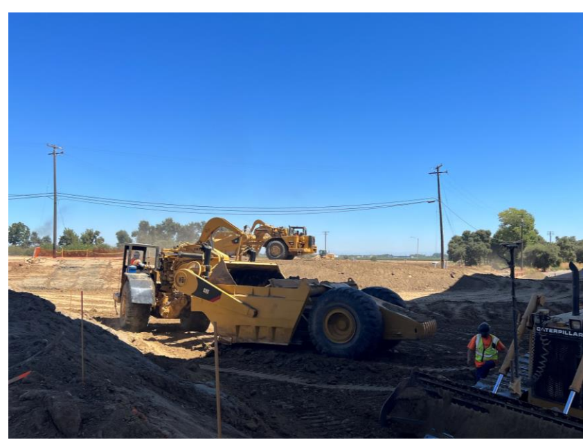
Reach B I-5 Window: Contractor backfilling project site at Interstate 5 cross over