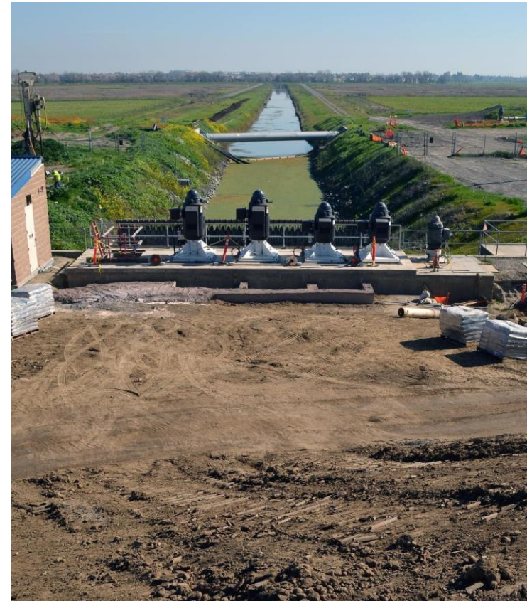
Pumping Plant #3 Backfill in Progress Winter 2022