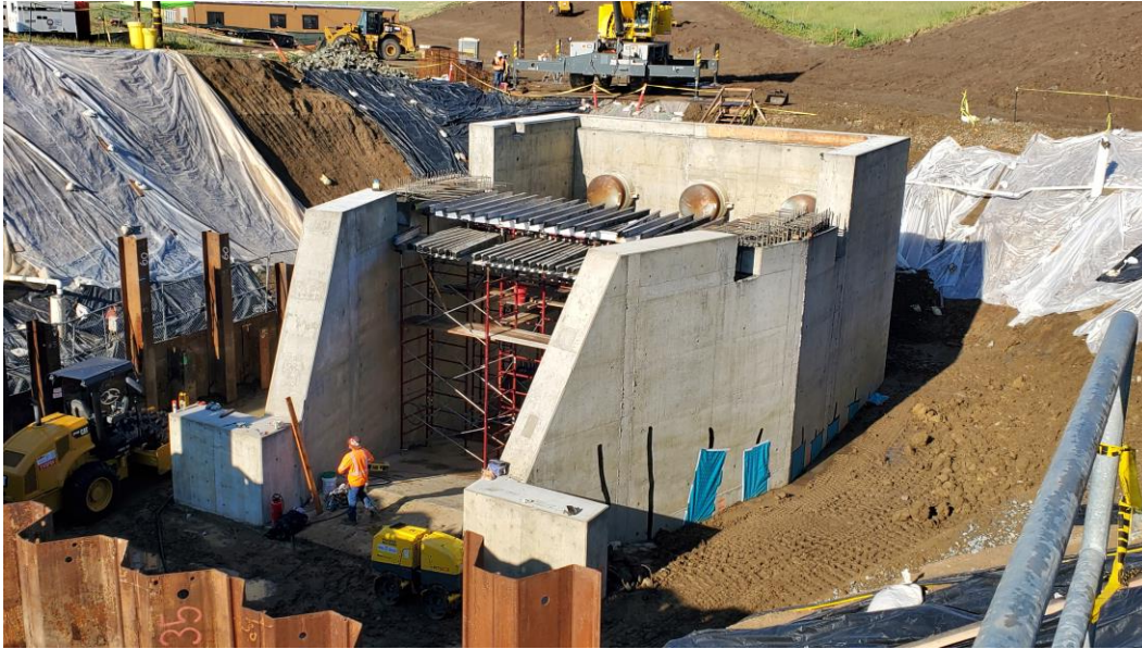
Pumping Plant #4 Structure Construction Spring 2022