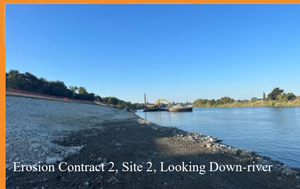
Erosion Contract 2, Site 2, Looking Down-river