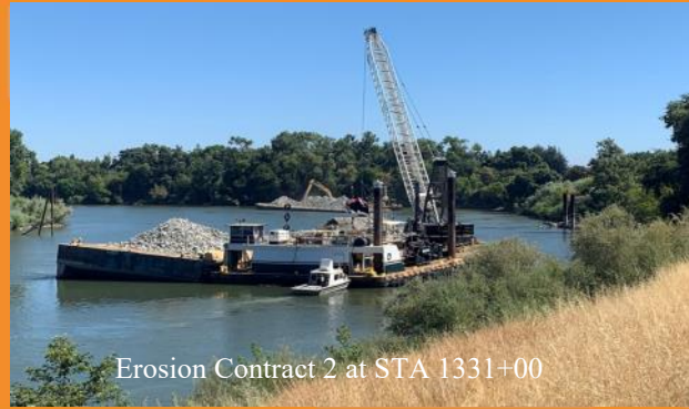
Erosion Contract 2 at STA 1331+00