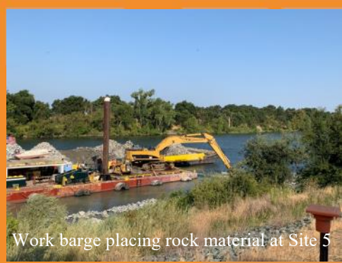
Work barge placing rock material at Site 5