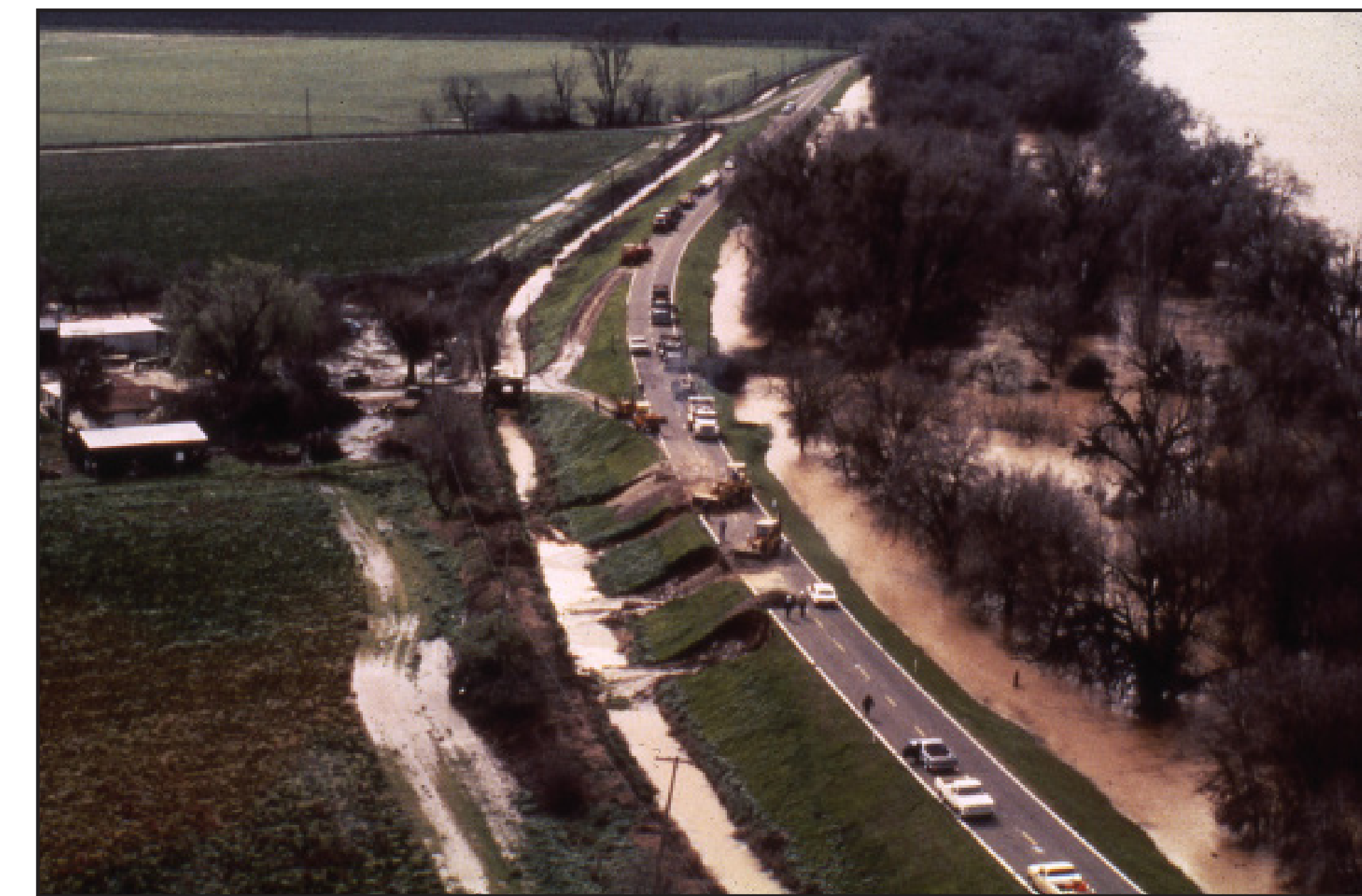
Seepage and stability problems