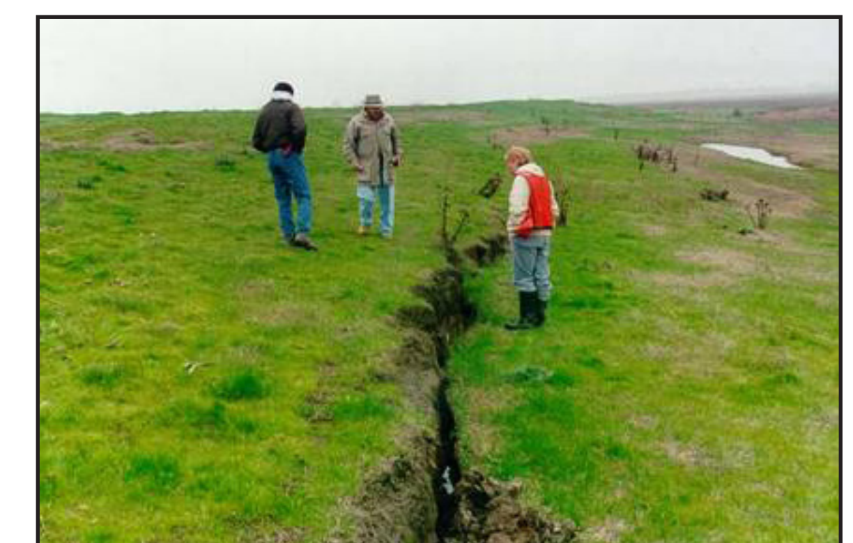
Levee instability problem