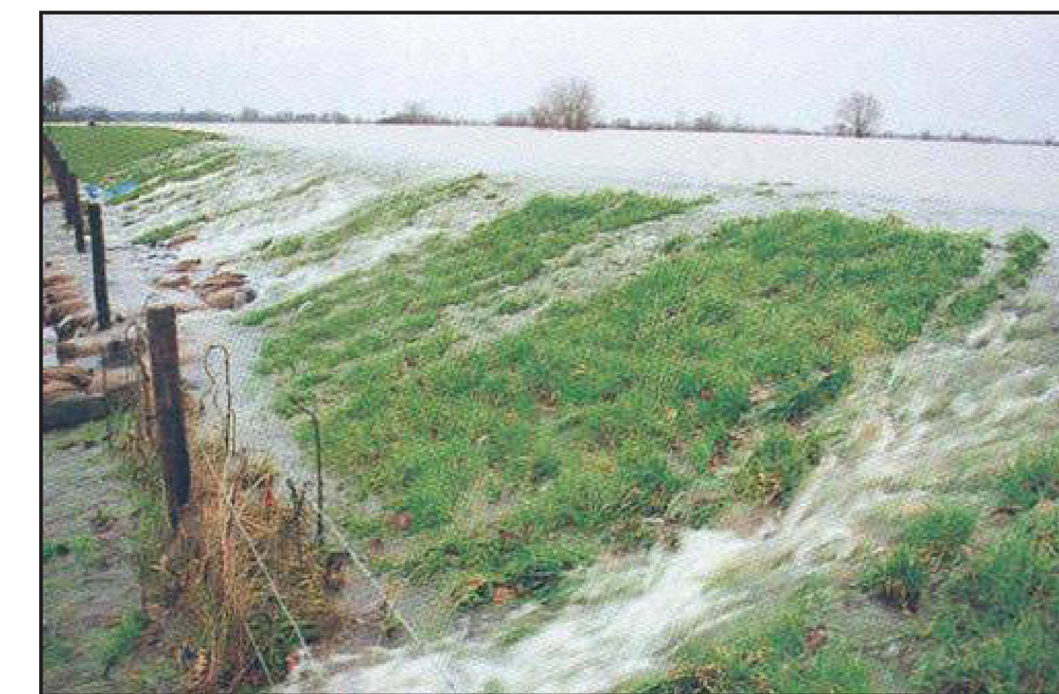
Levee overtopping problem