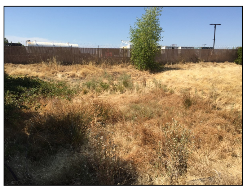
Photo 3. View of detention basin at the southeast corner of the Project Area, facing southwest. Photo taken July 19, 2018.