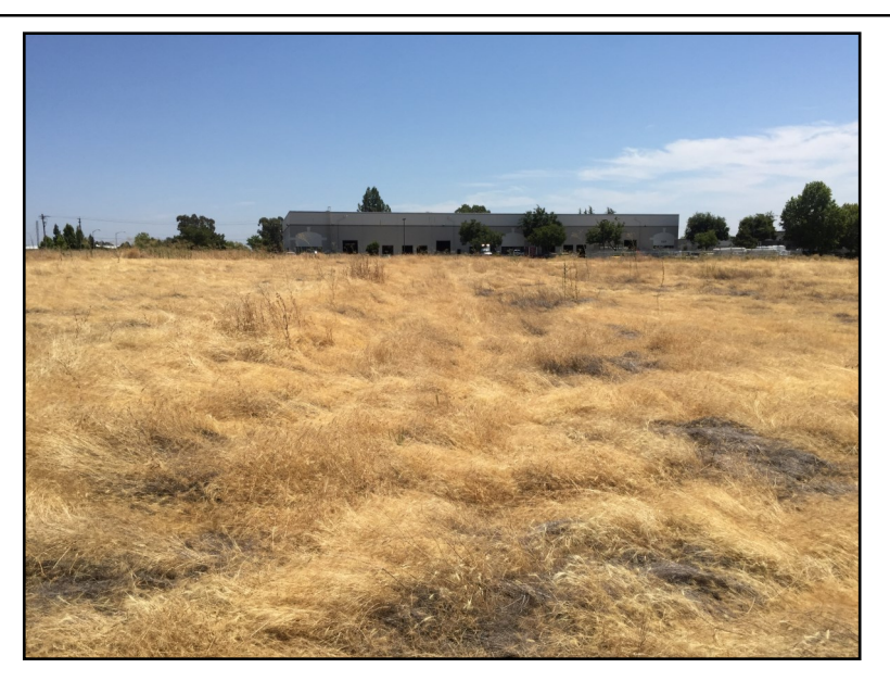
Photo 2. View of annual grassland facing east across the Project Area. Photo taken July 19, 2018.