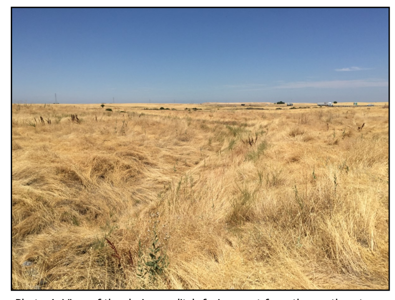
Photo 4. View of the drainage ditch facing west from the southeast corner of the Project Area. Photo taken July 19, 2018.