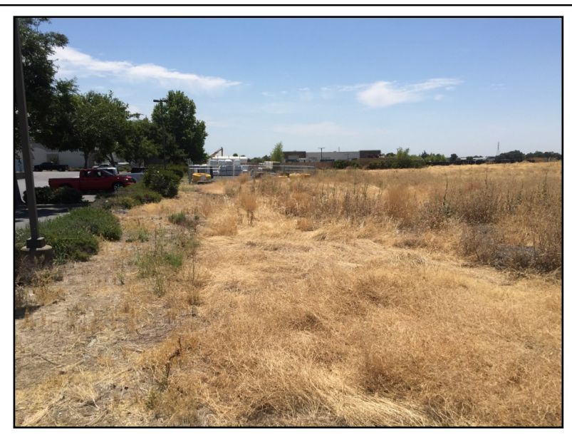
Photo 1. View facing south from the northeast corner along eastern boundary of Project Area. Photo taken July 19, 2018.